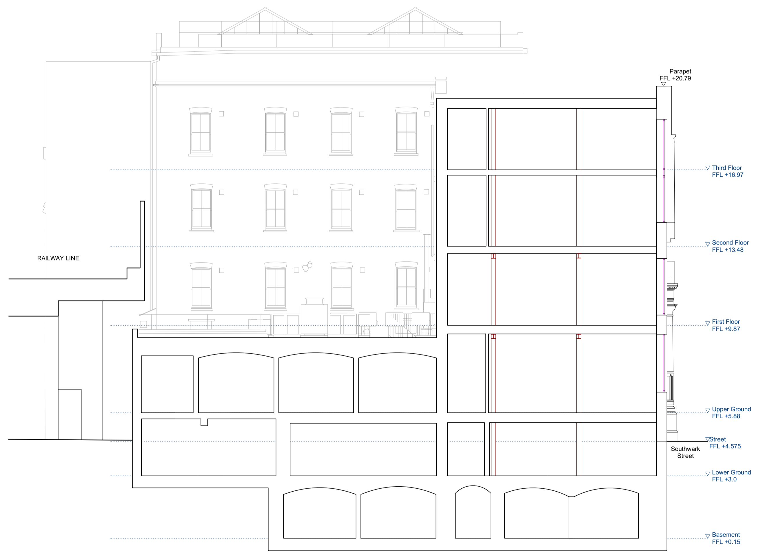
EXISTING SHORT SECTION C-C