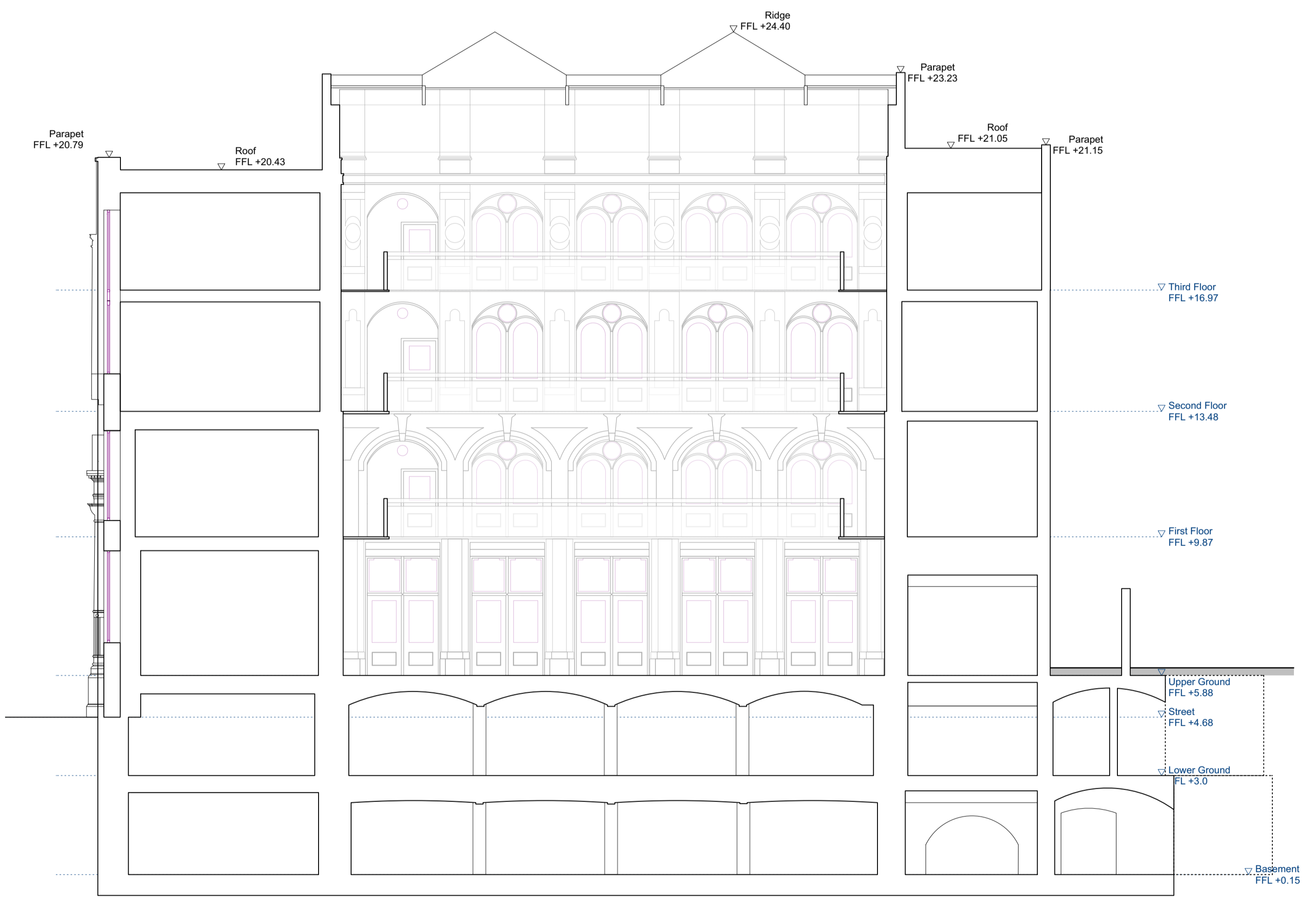
EXISTING SHORT SECTION B-B