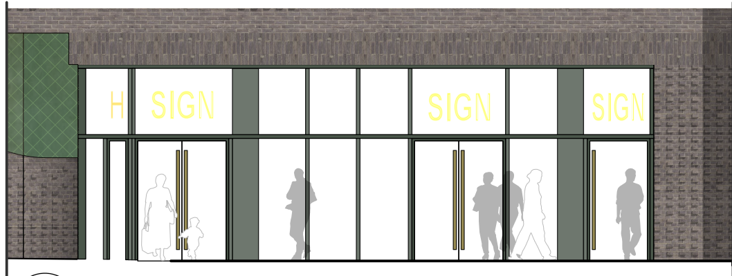
1 Proposed Restaurants Back Entrance -Elevation Scale: 1:100