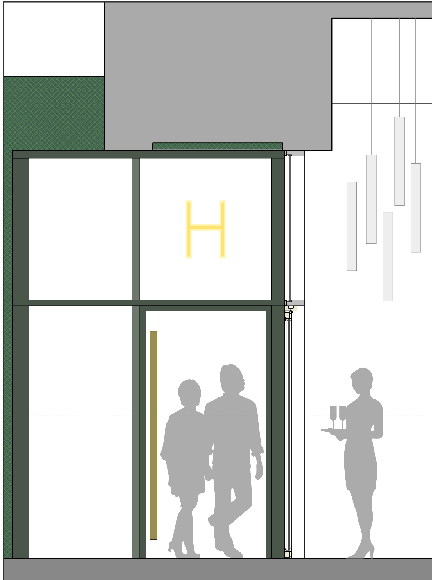
3 Proposed Restaurants Back Entrance - Section B-B Scale: 1:20

NOTES: Do not scale off this drawing. Drawings are indicative only. All site dimensions shown are based upon either those taken from the local Ordnance Survey or information supplied to us by others. Forge Architects and Surveyors Ltd accept no responsibility for the accuracy of any site information conveyed in these drawings and it should not be relied upon as being accurate. This drawing and design is the copyright of Forge Architects and Surveyors Ltd and is not to be used for any purpose without their written consent.