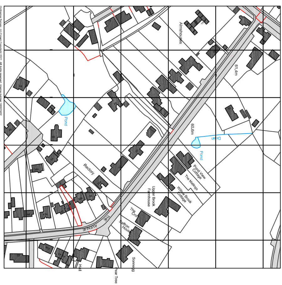
Location Plan 1:1250 @ A1 1:625 @ A3