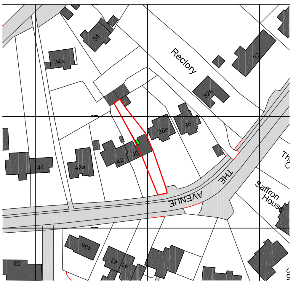
Site Plan 1:500 @ A1 1:250 @ A3