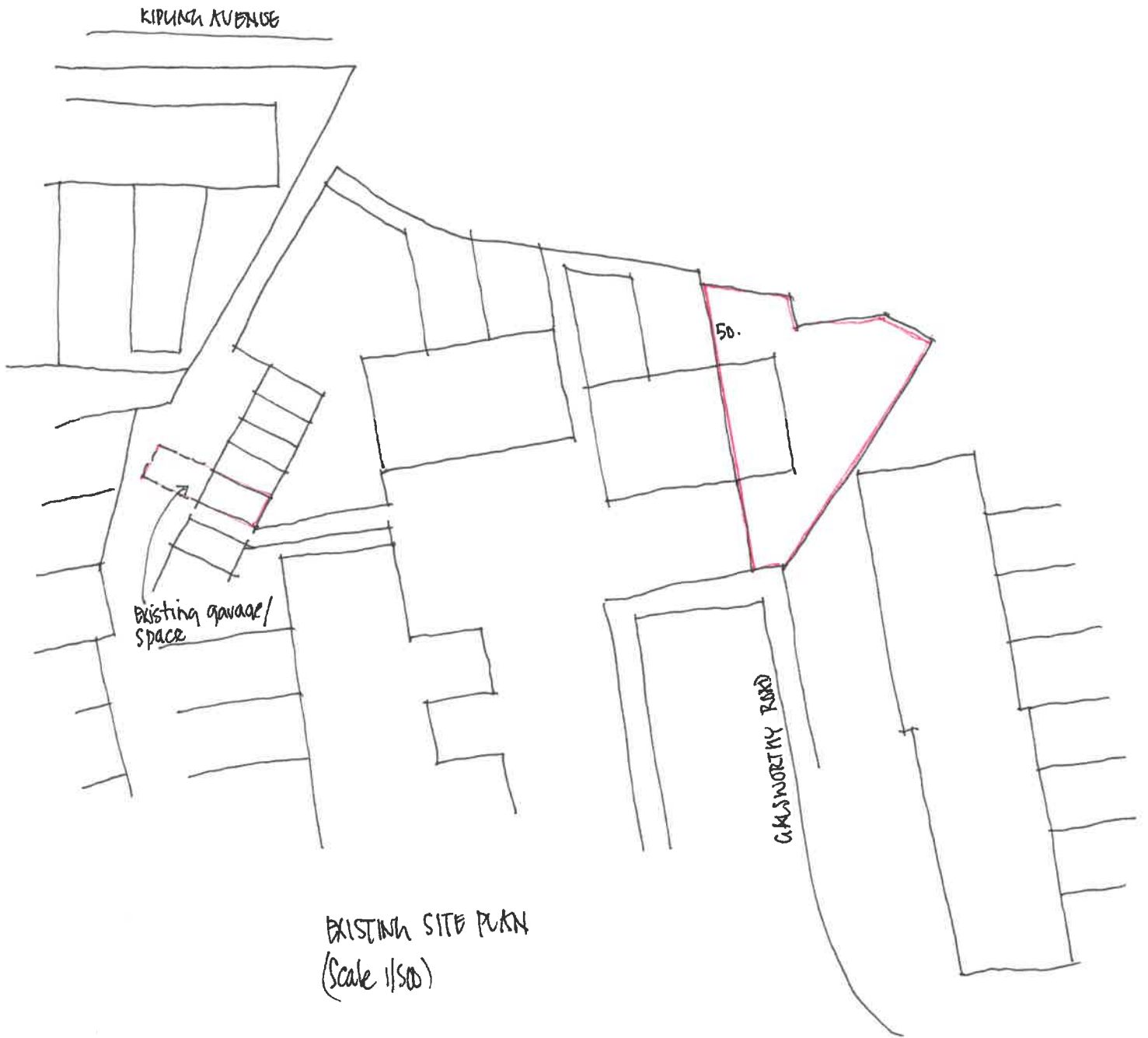
EXISTING SITE PLAN (Scale 1/500)