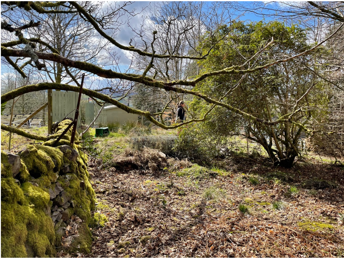
existing view from top of site at approx 144m level shows stone wall collapsing and scrub plants