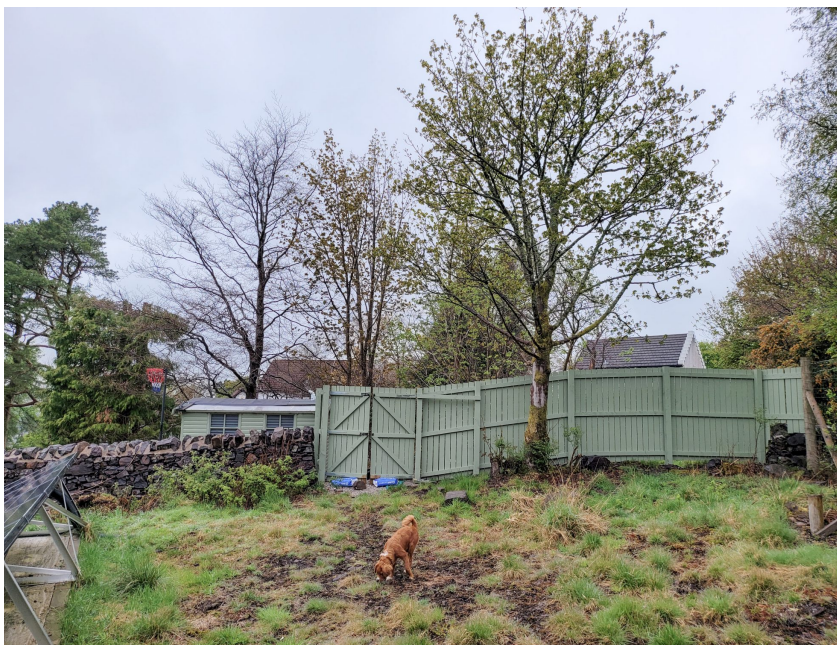
proposed garden room building built on old wall edge as photomontage (existing view above)