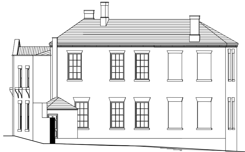
EXISTING EAST ELEVATION SCALE 1:200