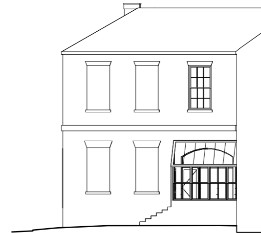
EXISTING WEST ELEVATION SCALE 1:200

Do not scale from this drawing. Figured dimensions are taken to structure unless indicated otherwise. All dimensions to be checked on site prior to commencement of work. Drawing to be read in conjunction with all other Architect's drawings, Consultant's and Specialist's drawings, construction notes and specifications.