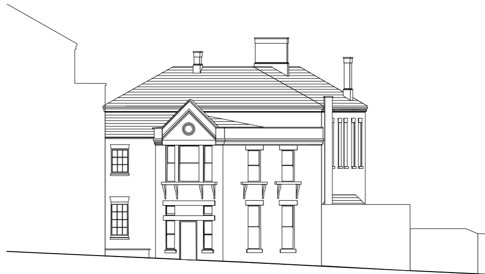
EXISTING NORTH ELEVATION SCALE 1:200