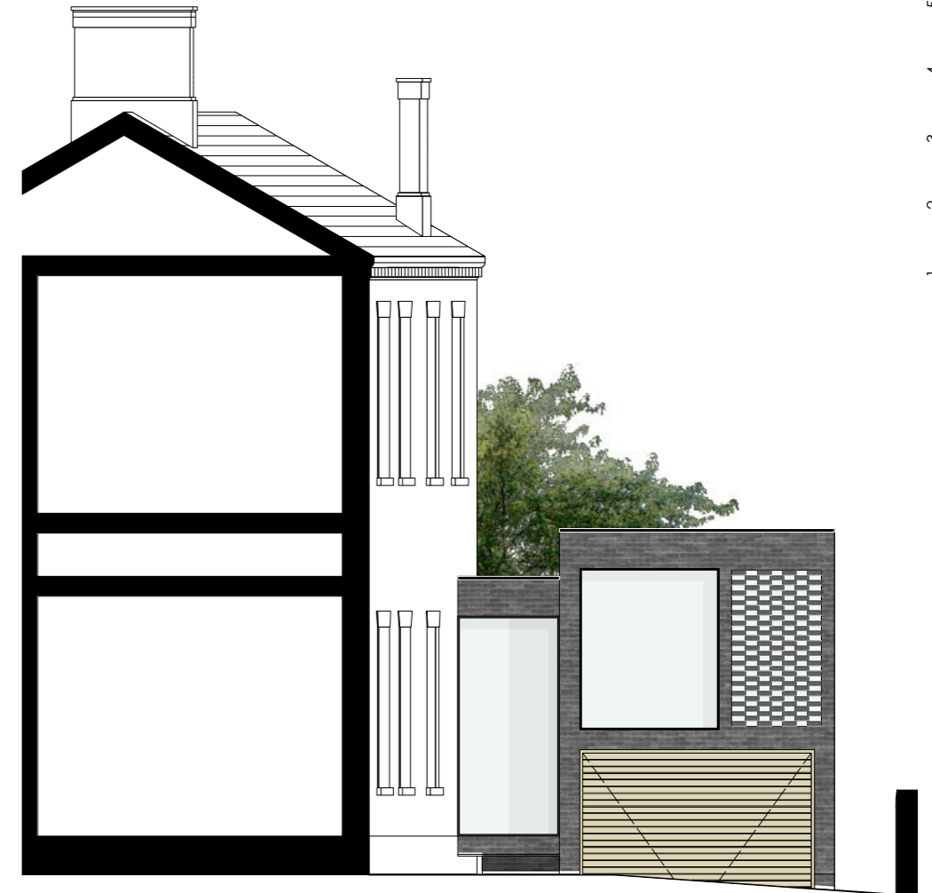
PROPOSED NORTH ELEVATION SCALE 1:100