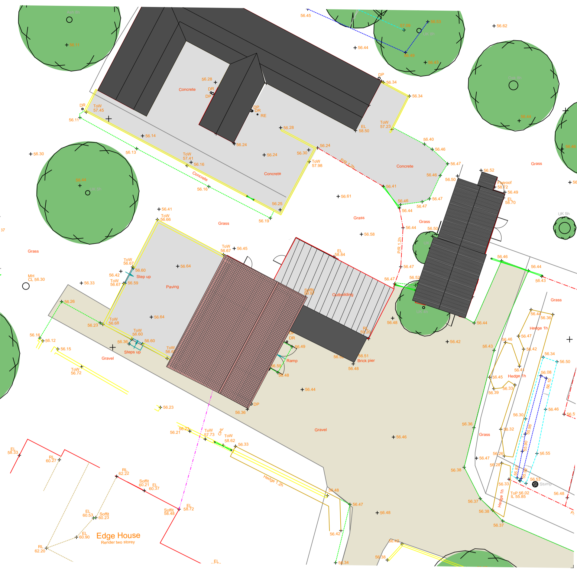
BLOCK PLAN Scale 1:200