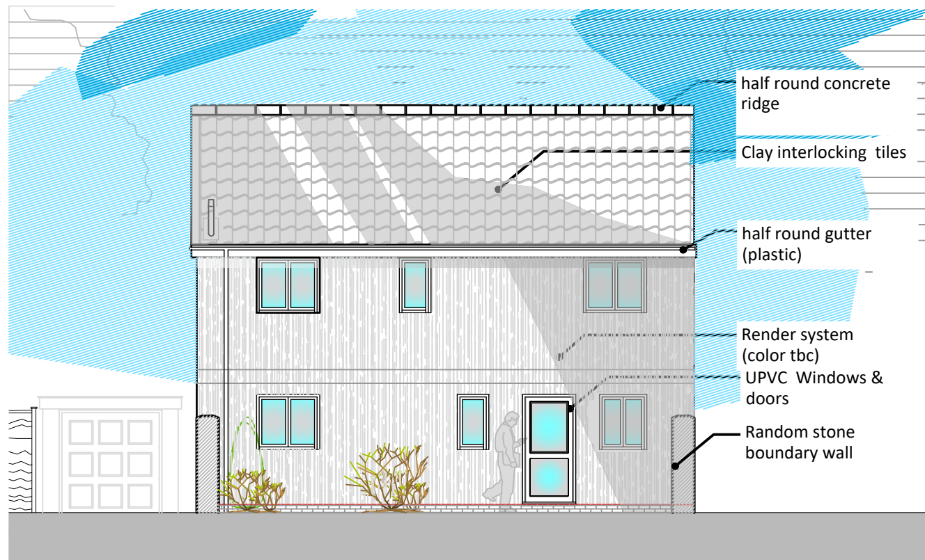
PROPOSED - Rear Elevation