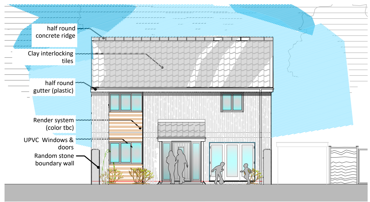
PROPOSED - Front Elevation