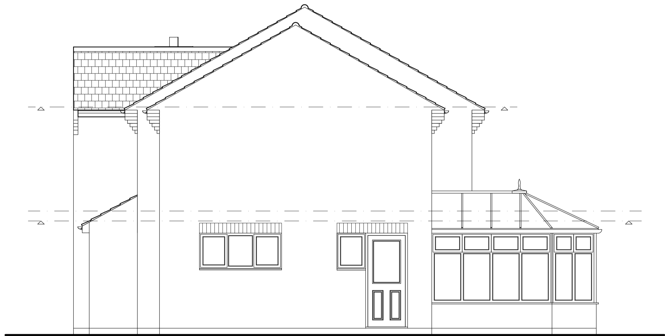
EXISTING SIDE ELEVATION 1:50