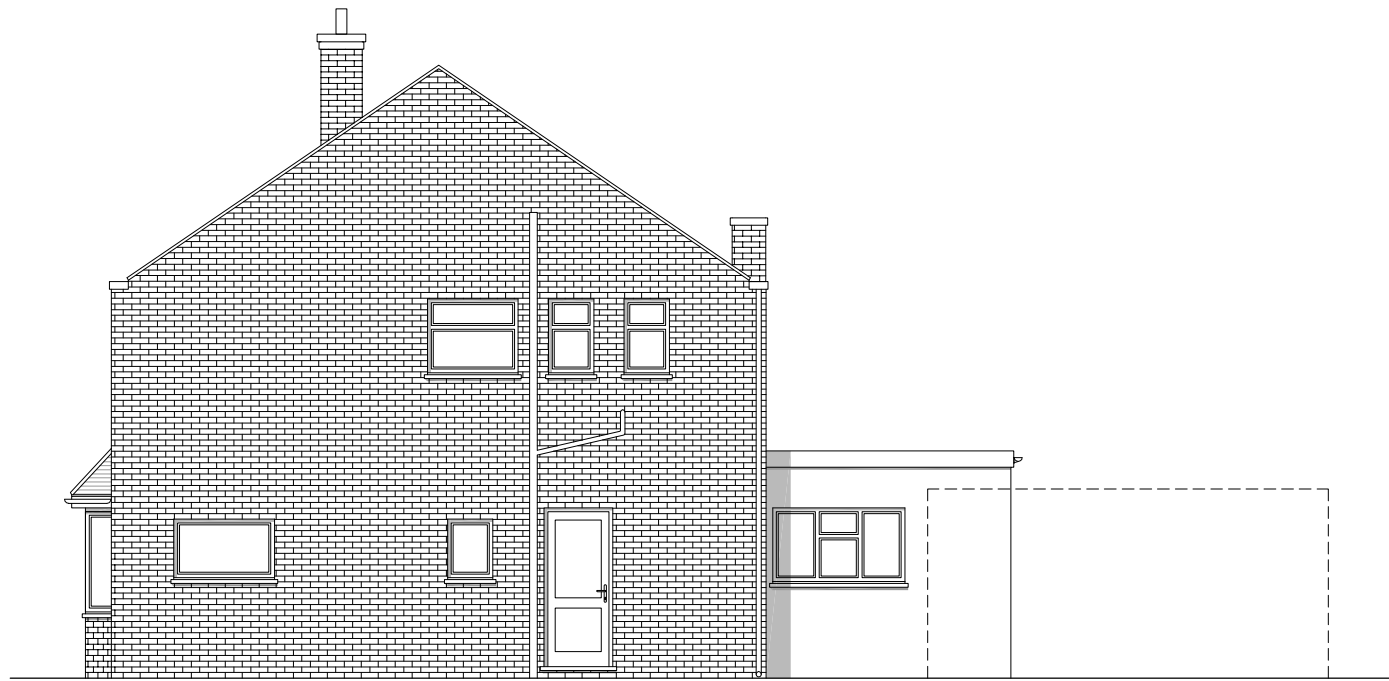
3 FLANK ELEVATION SOUTH ELEVATION SCALE 1:100