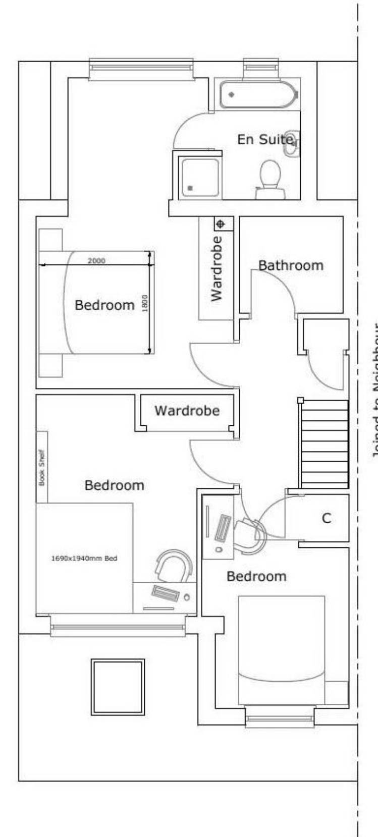
Proposed First Floor Plan