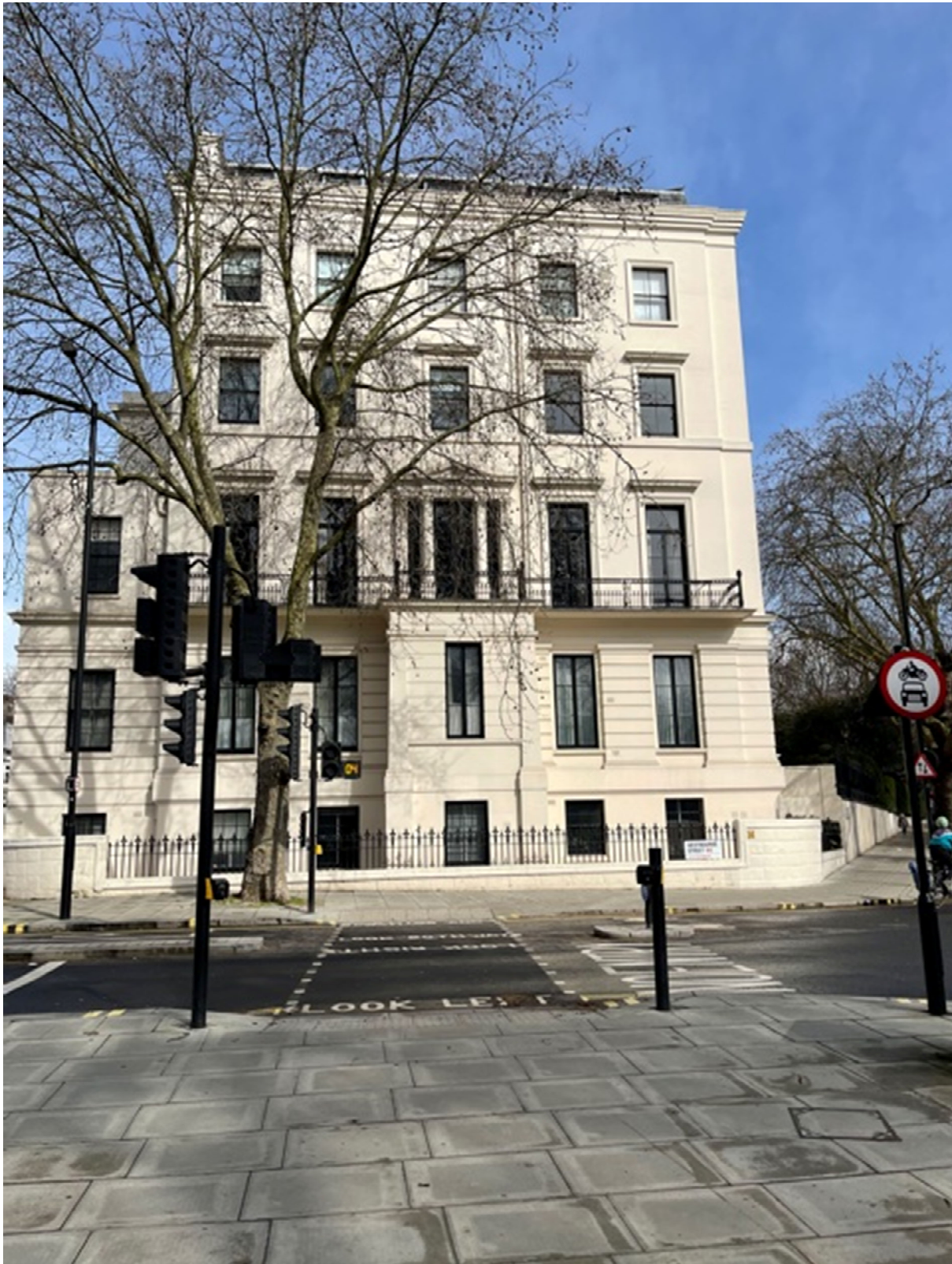
35 Stanhope Terrace as viewed from Westbourne Street