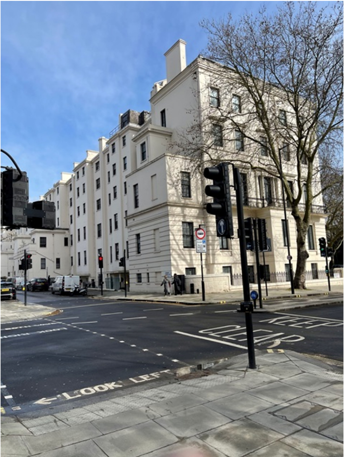
35 Stanhope Terrace as viewed from corner of Stanhope Terrace and Westbourne Street