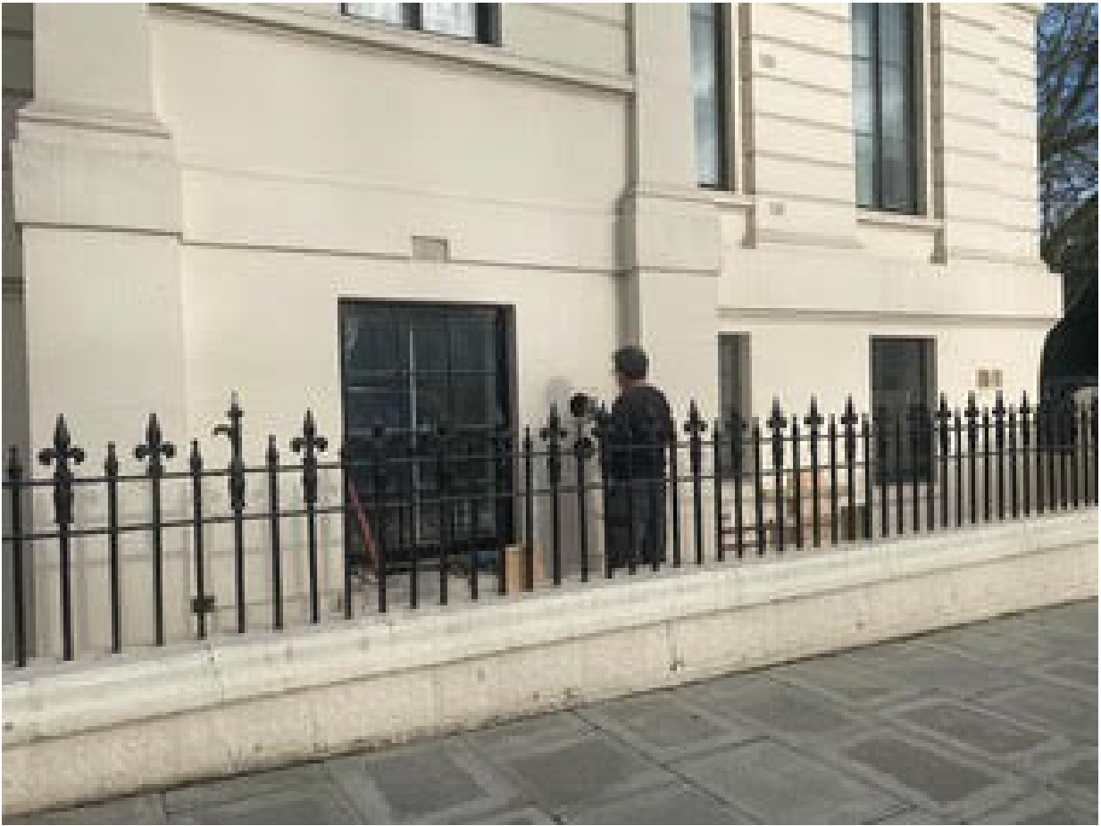
35 Stanhope Terrace viewed from Westbourne Street