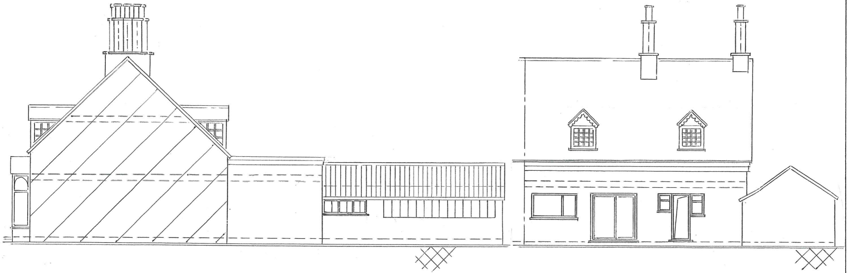
SIDE VIEW. _____