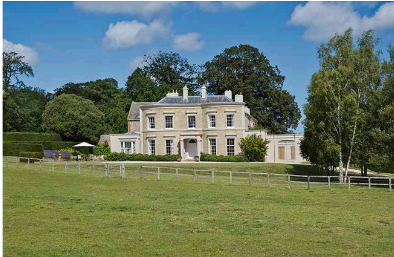
The South front of the Parsonage House

To the North of the house are garages. A brick wall forms the Northern boundary of the property.