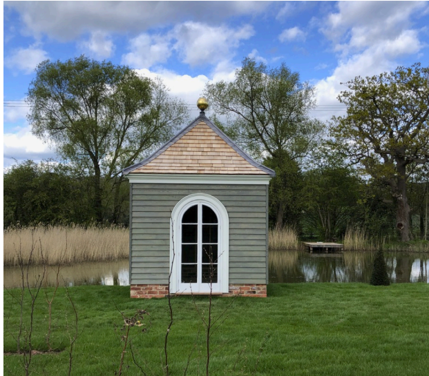
A similar 3m square pavilion to that proposed

The pavilions are proposed to be of timber construction clad in sawn finish grey stained feather-edge boarding. The roofs are of cedar shingles with lead hips. The cornice below the roof is of painted timber and the doors are of off white painted hardwood. The proposed footprint is 3m x 3m and ht 4.3m ground to apex of pyramidal roof. A detached brick hearth is proposed between the pavilions in front of the existing brick wall.