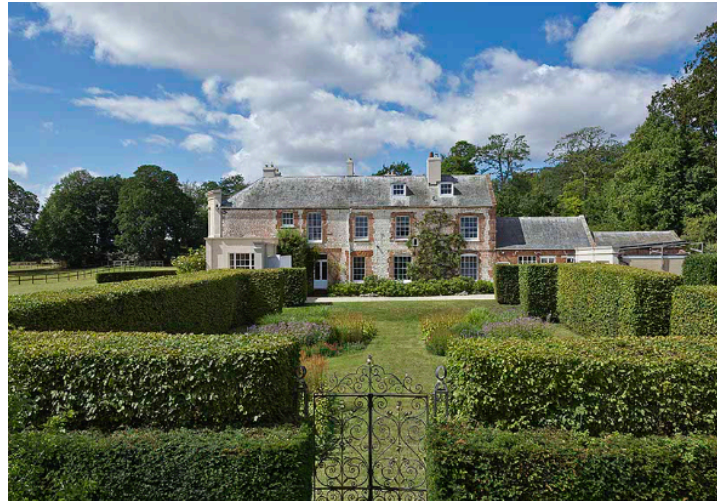
The East front of the Parsonage House with modern garages on the right hand side