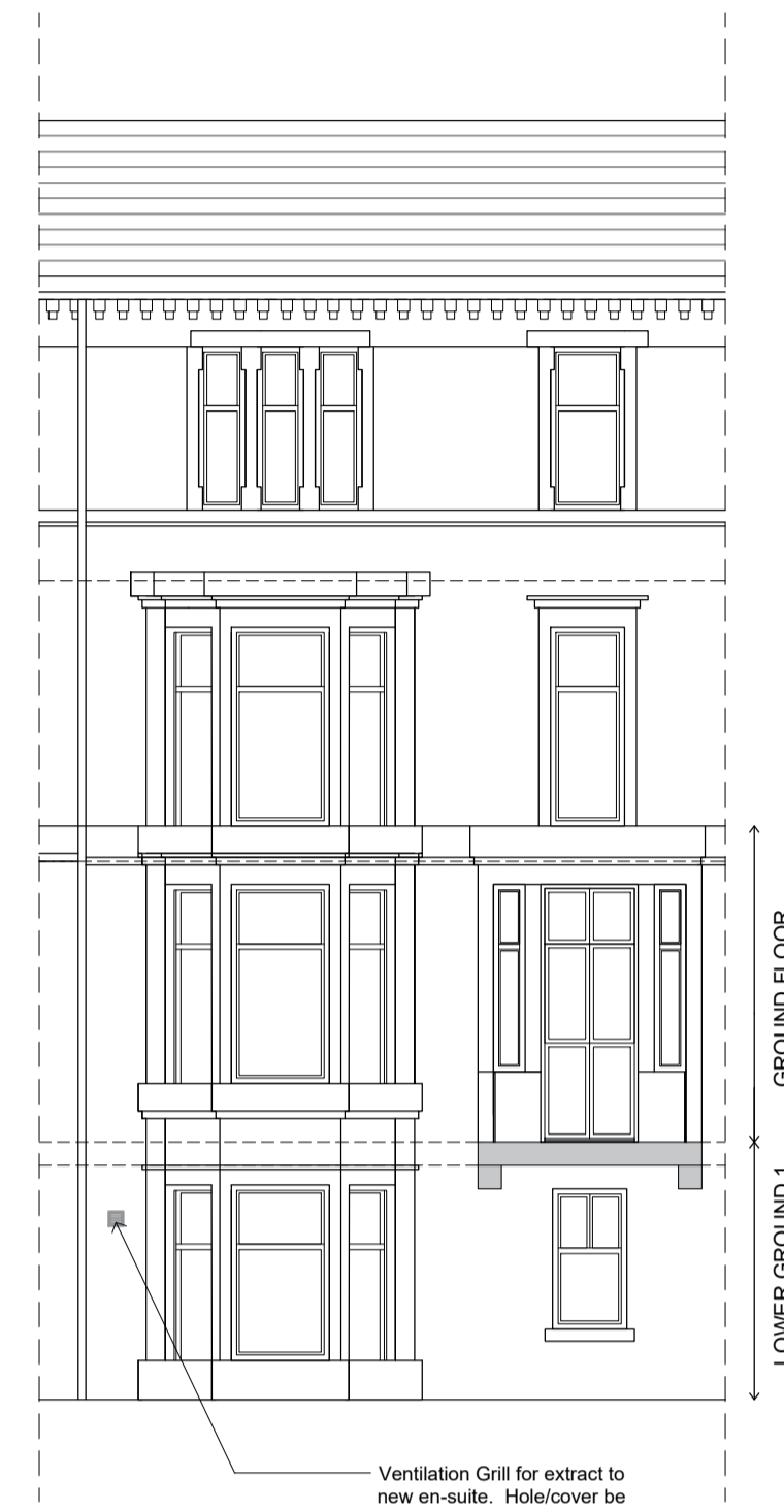
02 Front Elevation As Proposed 1:100 @ A1