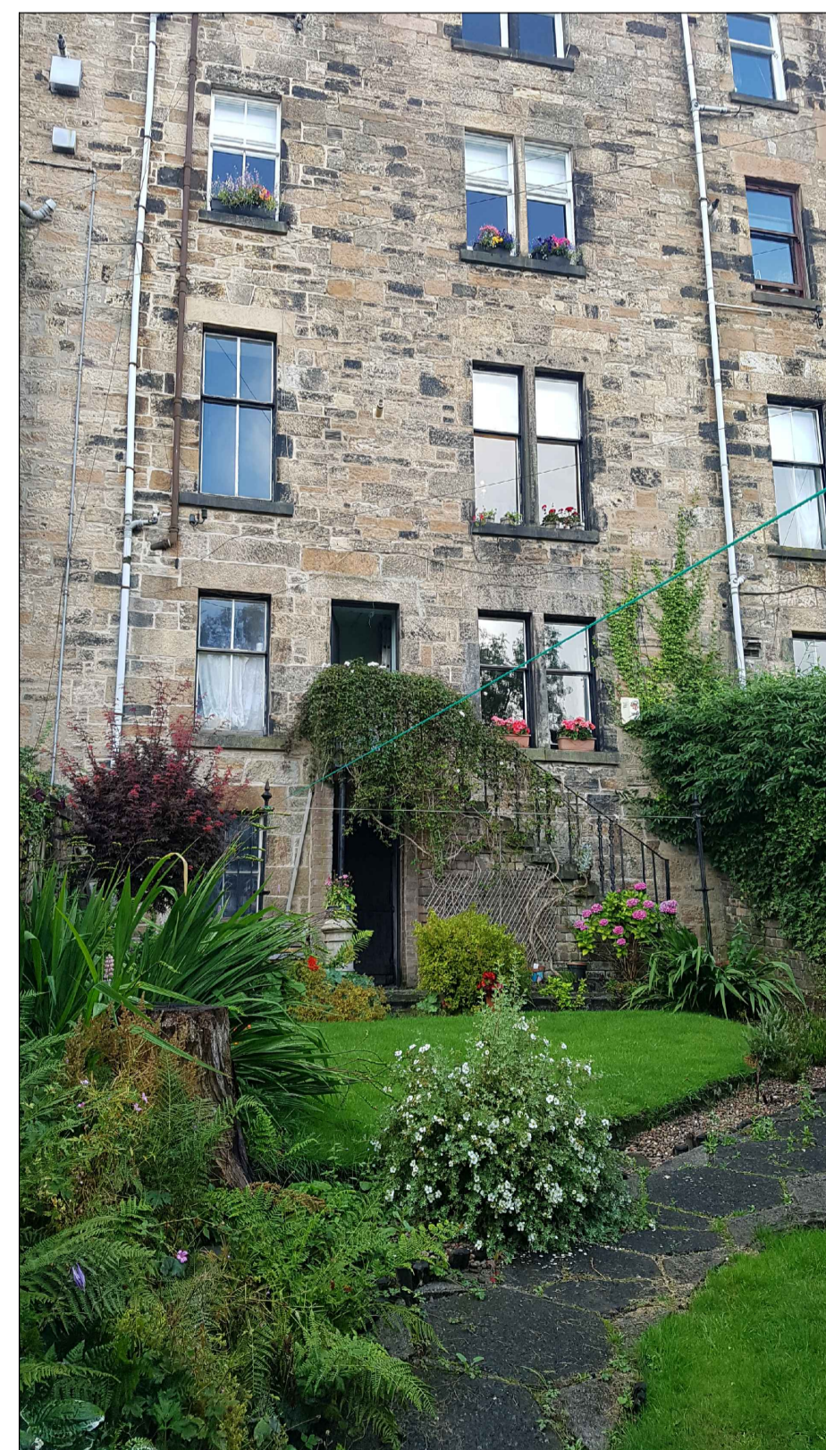
03 Photo of Rear Elevation NTS