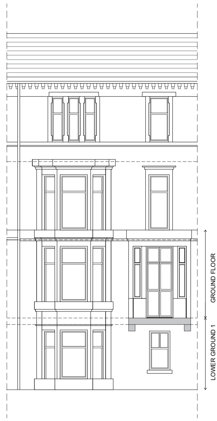
01 Front Elevation As Existing 1:100 @ A1