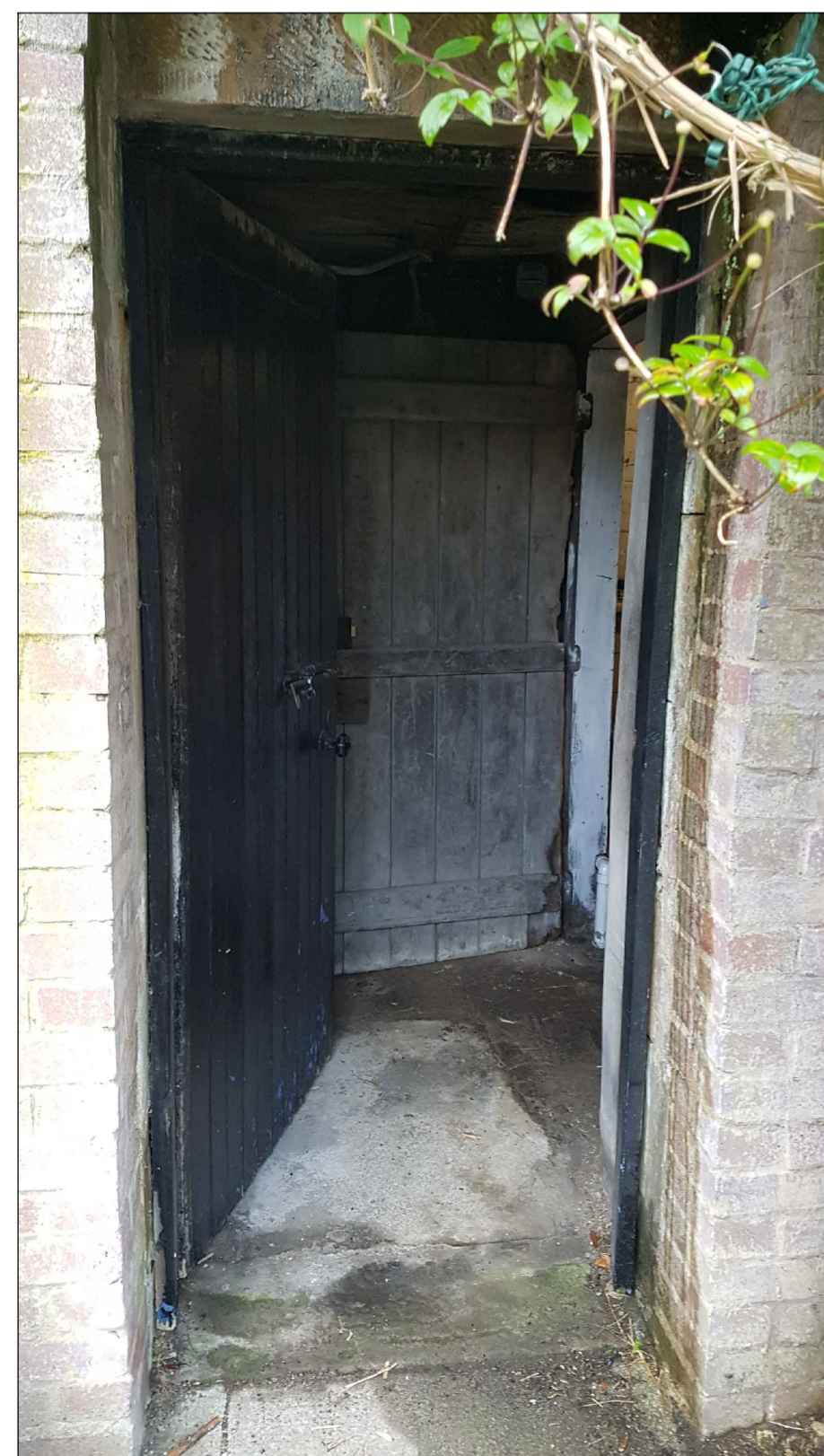
04 Photo of Door to be Replaced NTS

Do not scale from this drawing. This drawing is to be read in conjunction with all relevant architecture, civil / structural and service engineers drawings and specifications. All dimensions are shown in metric. This drawings remains the copyright of. TECHNIQUE ARCHITECTURE AND DESIGN LTD.