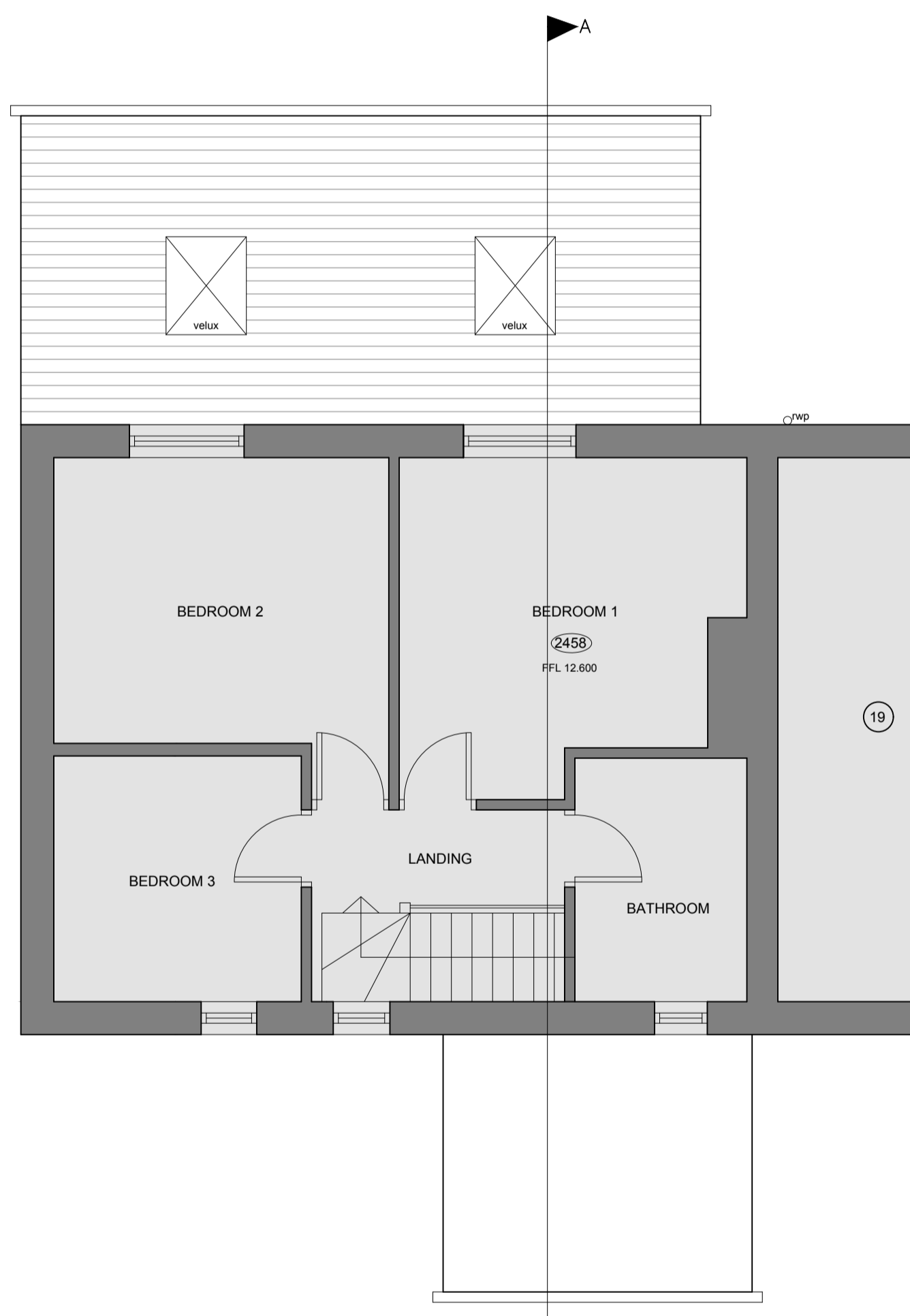
FIRST FLOOR PLAN (As Proposed)