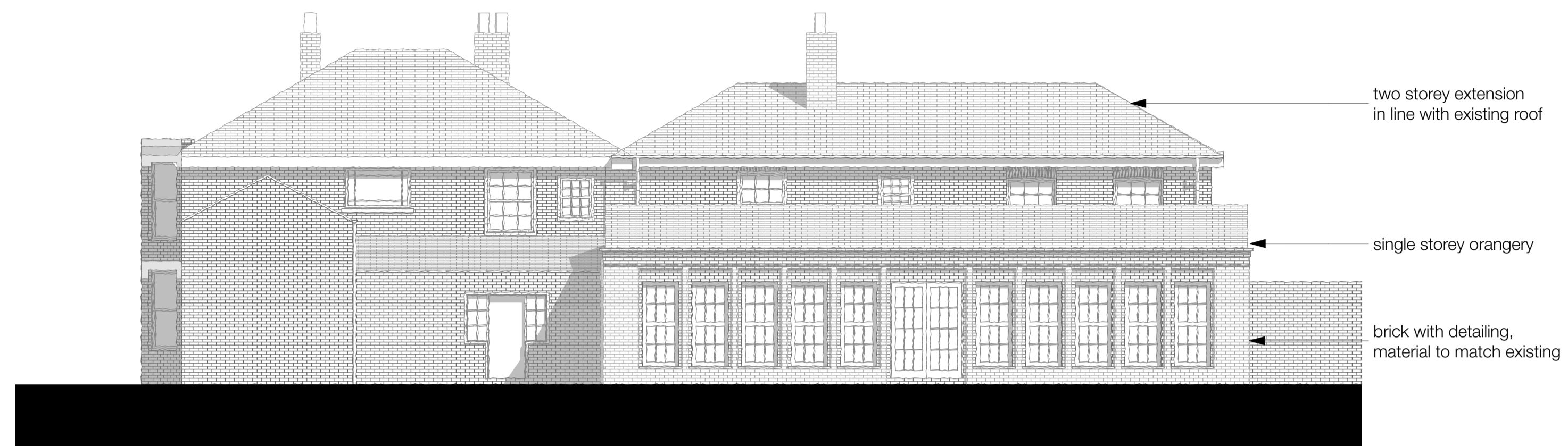
E-02 Main Elevation - Proposed 1:100