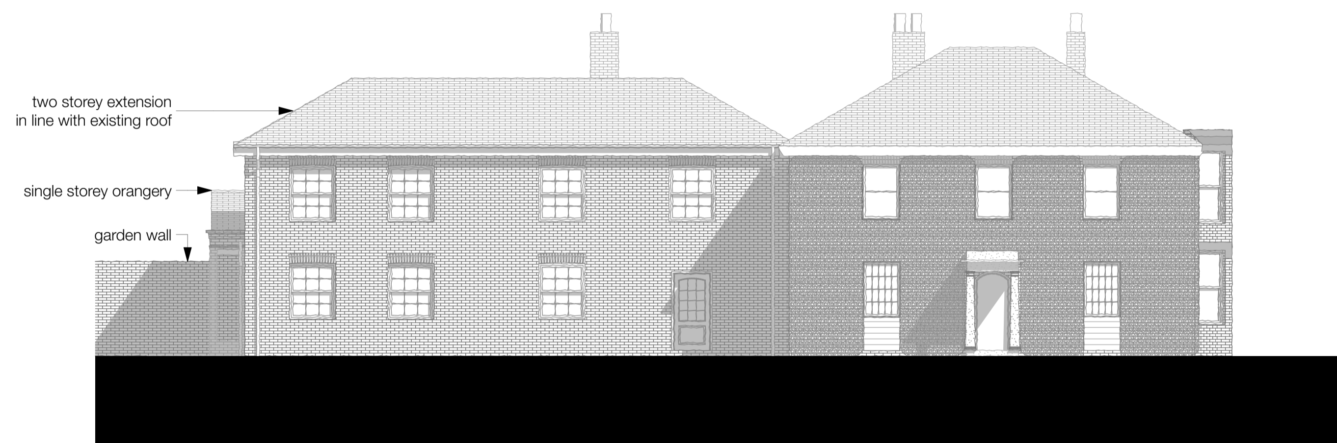
E-04 Rear Elevation - Proposed 1:100