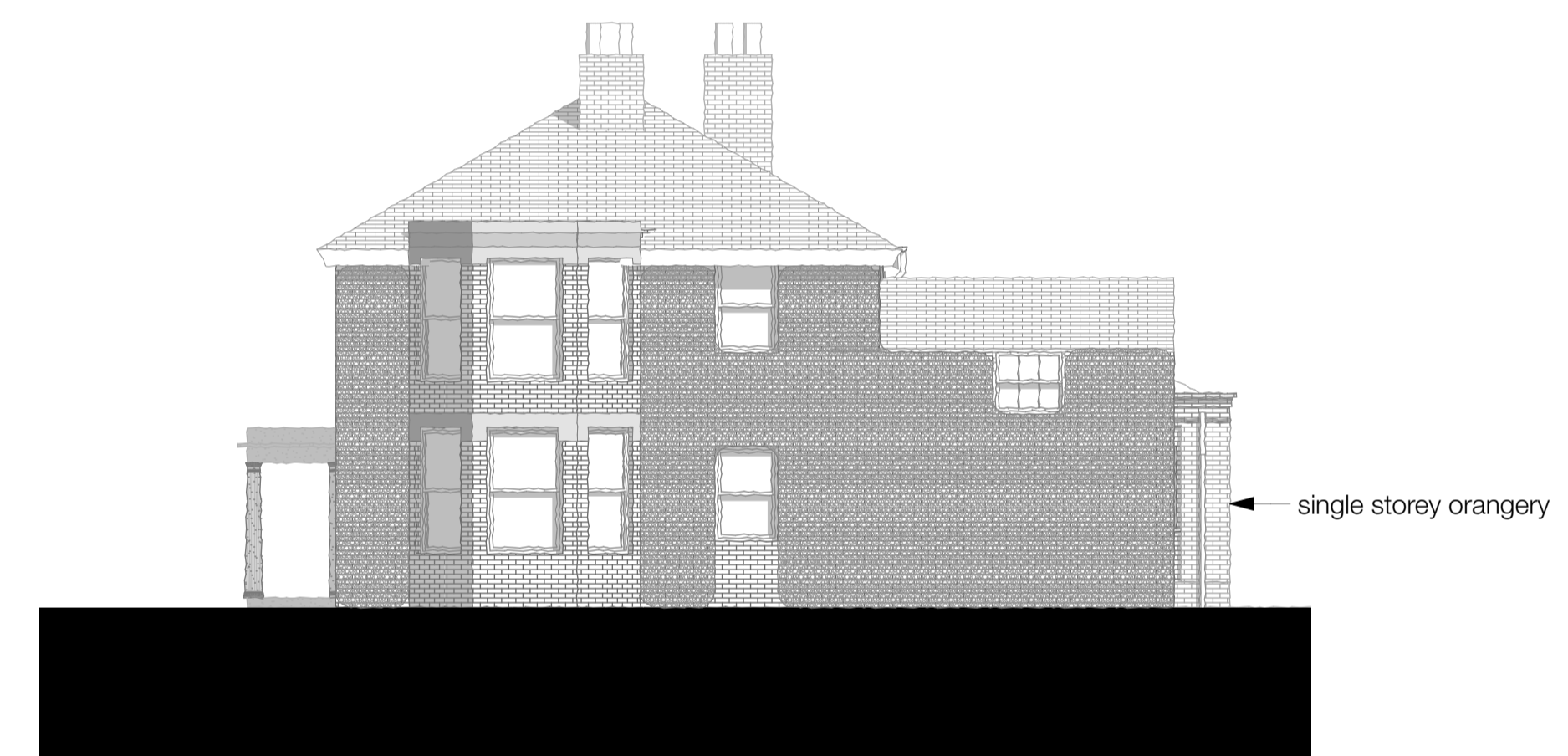
E-05 Side Elevation - Proposed 1:100