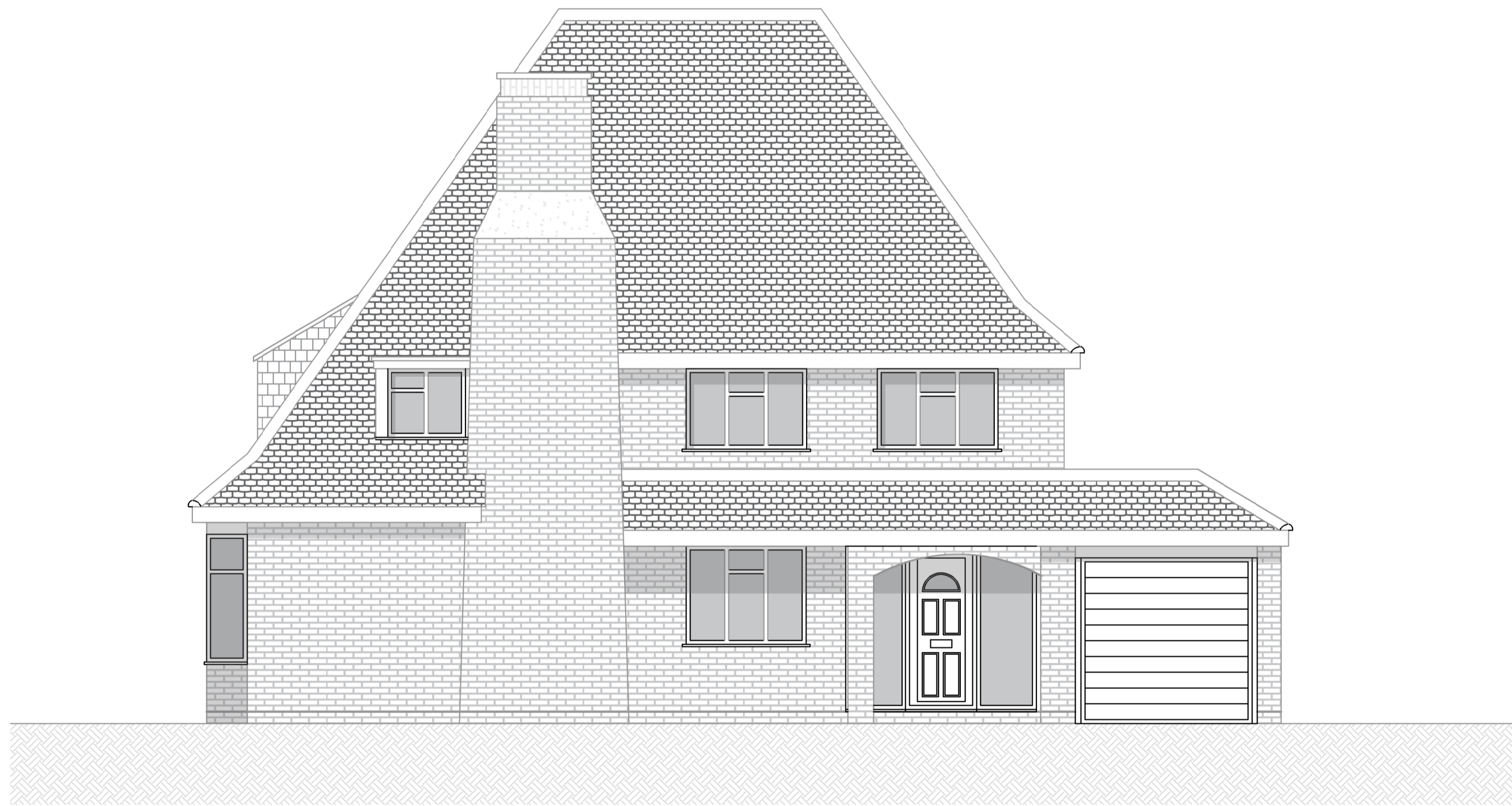
Existing South Elevation @ 1:50