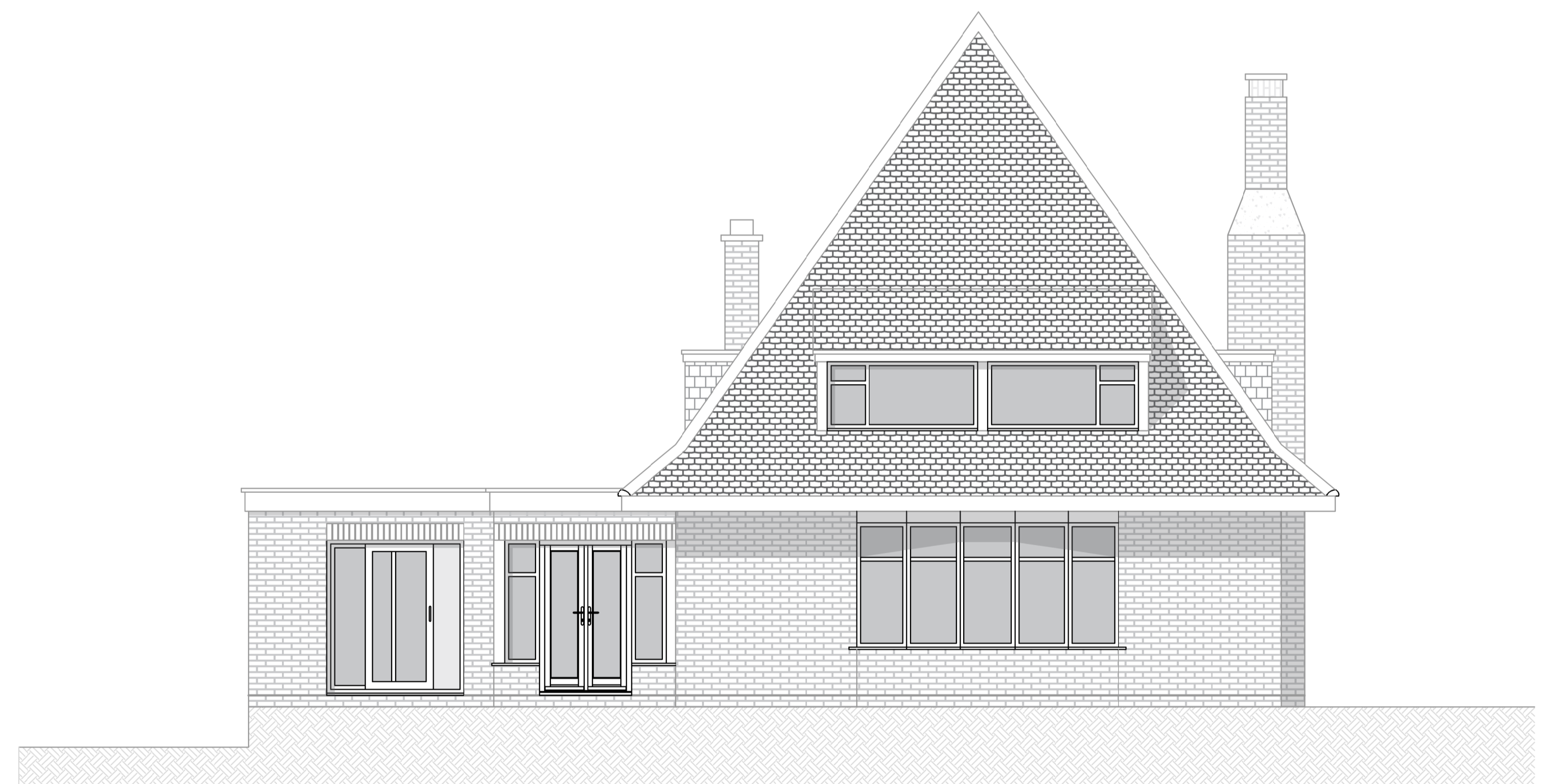
Existing West Elevation @ 1:50