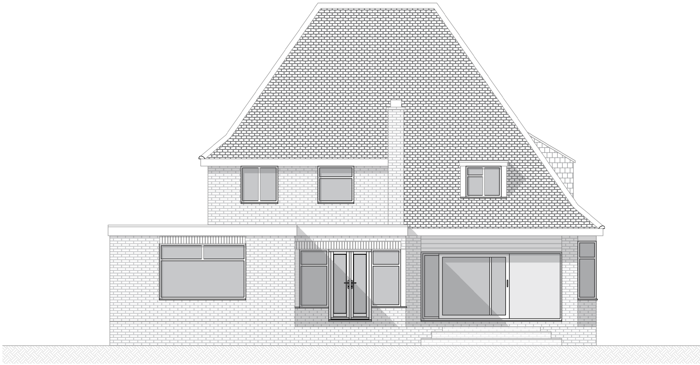
Proposed North Elevation @ 1:50