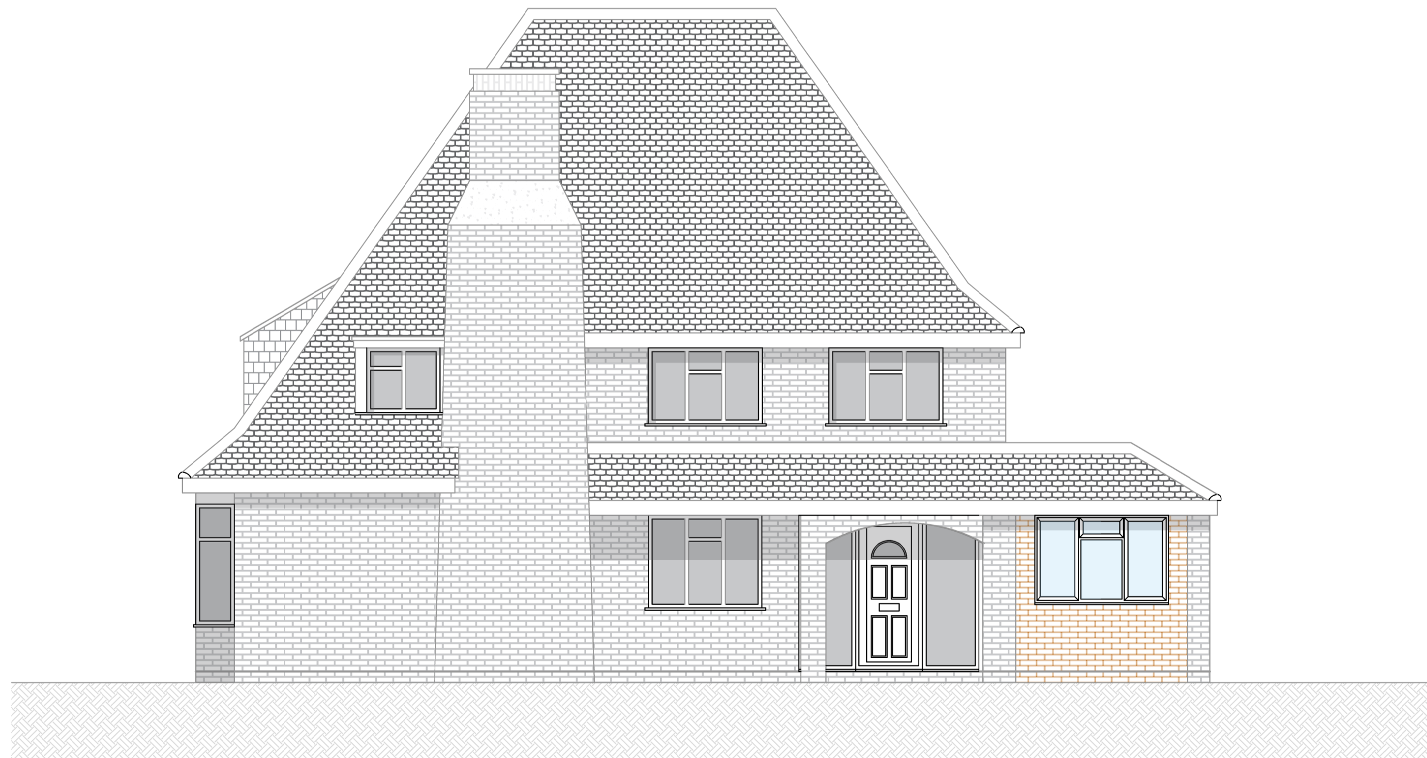
Proposed South Elevation @ 1:50