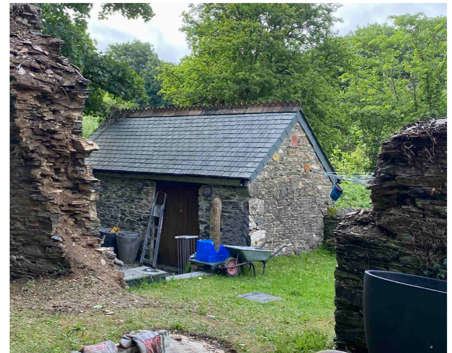
Existing outbuilding aesthetic