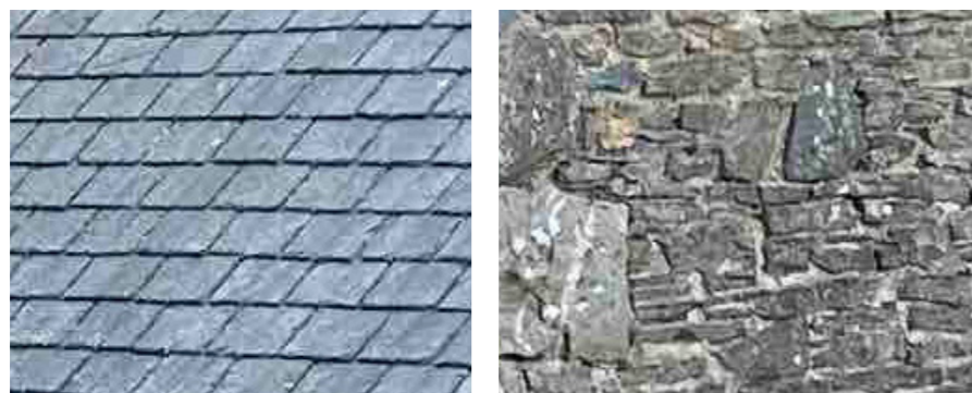
Slate + stone to match other existing outbuilding

The garage is proposed to be subservient to the main house with its use of traditional materials helping to blend into the landscaping.