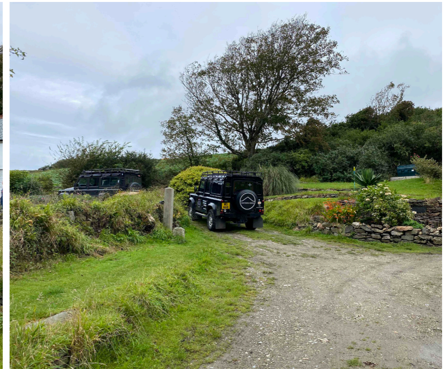
View of driveway bending to the left to location of old outbuilding stub walls.