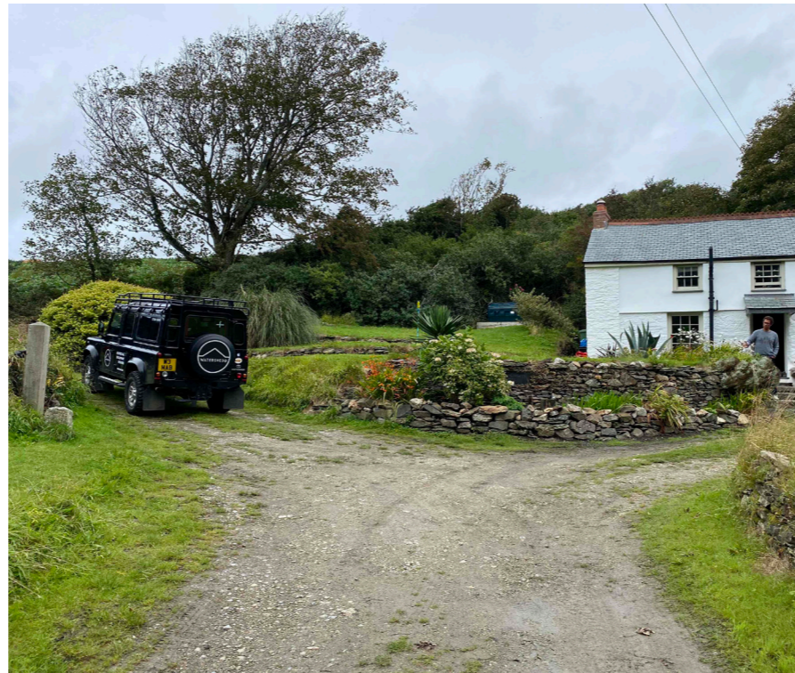
View of existing driveway