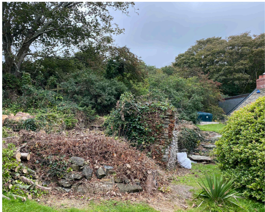
View of what's left of the old outbuilding stub walls