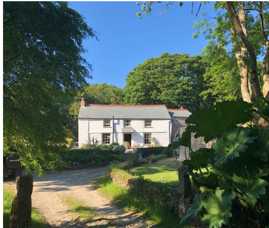
View of the property from the entrance gate