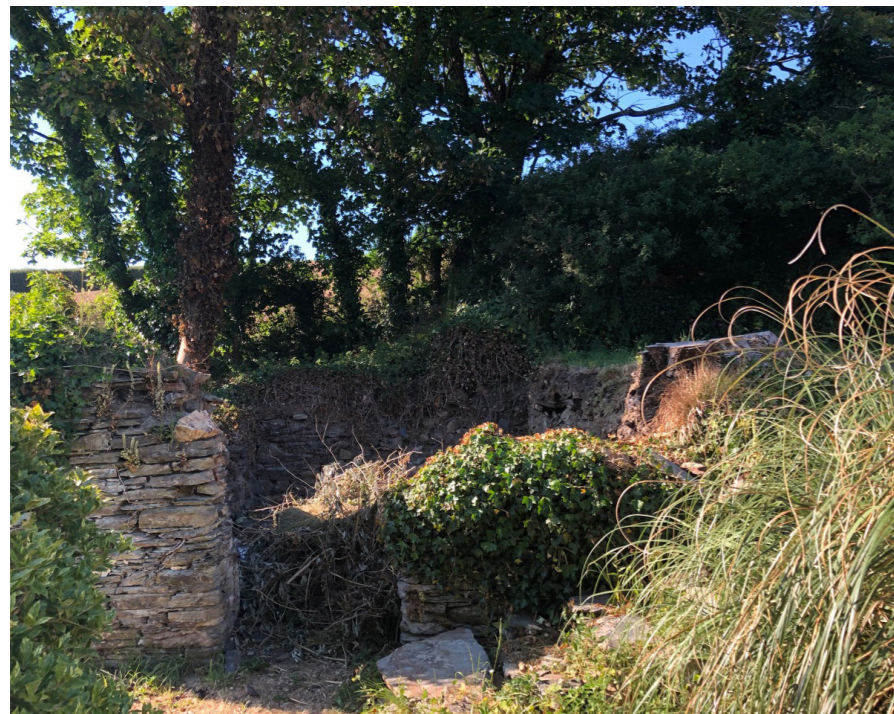
View of what's left of the old outbuilding stub walls