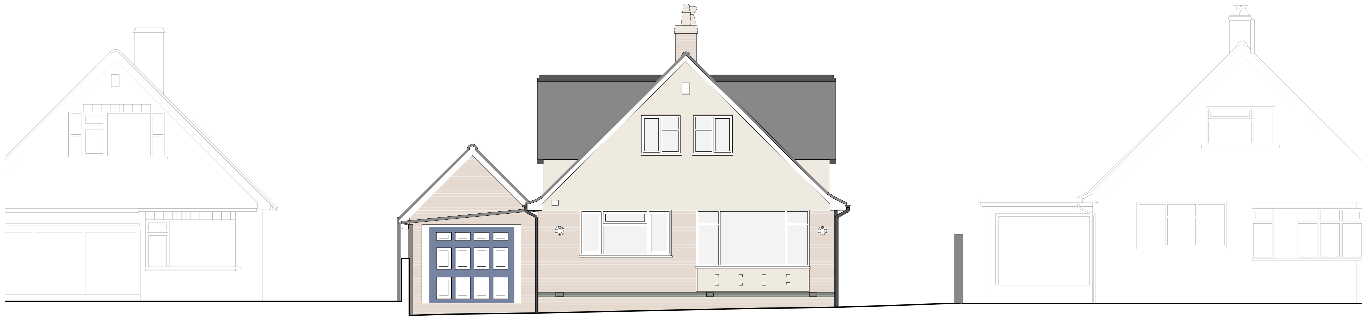
Front Elevation A