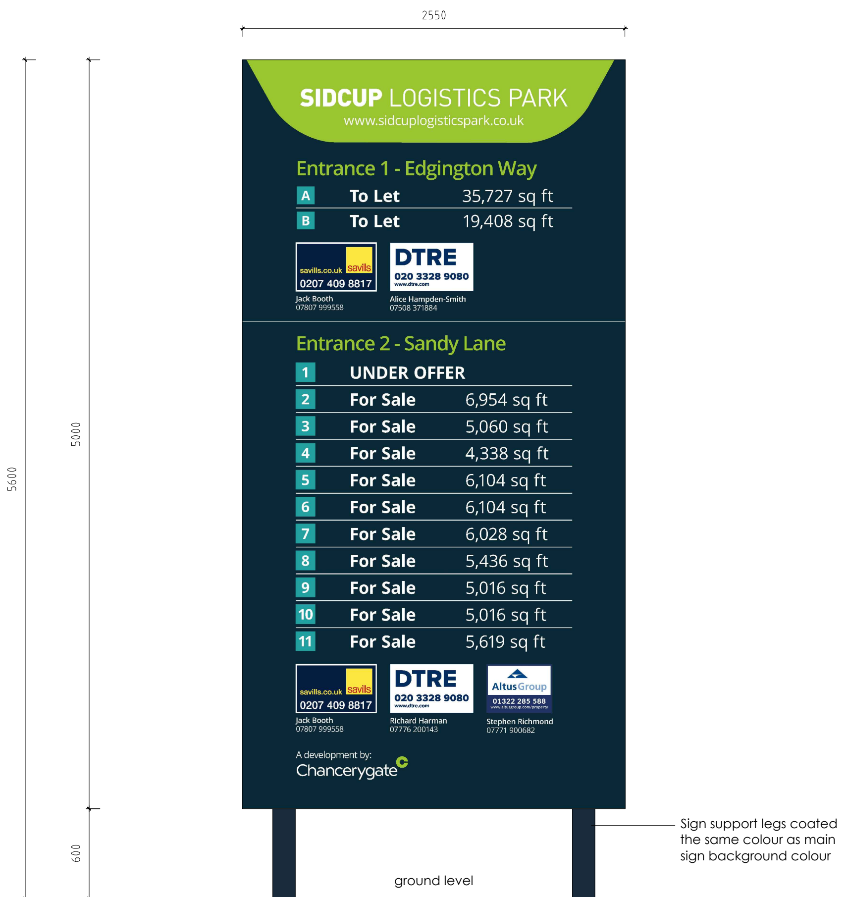
PROPOSED ESTATE SIGN ELEVATION