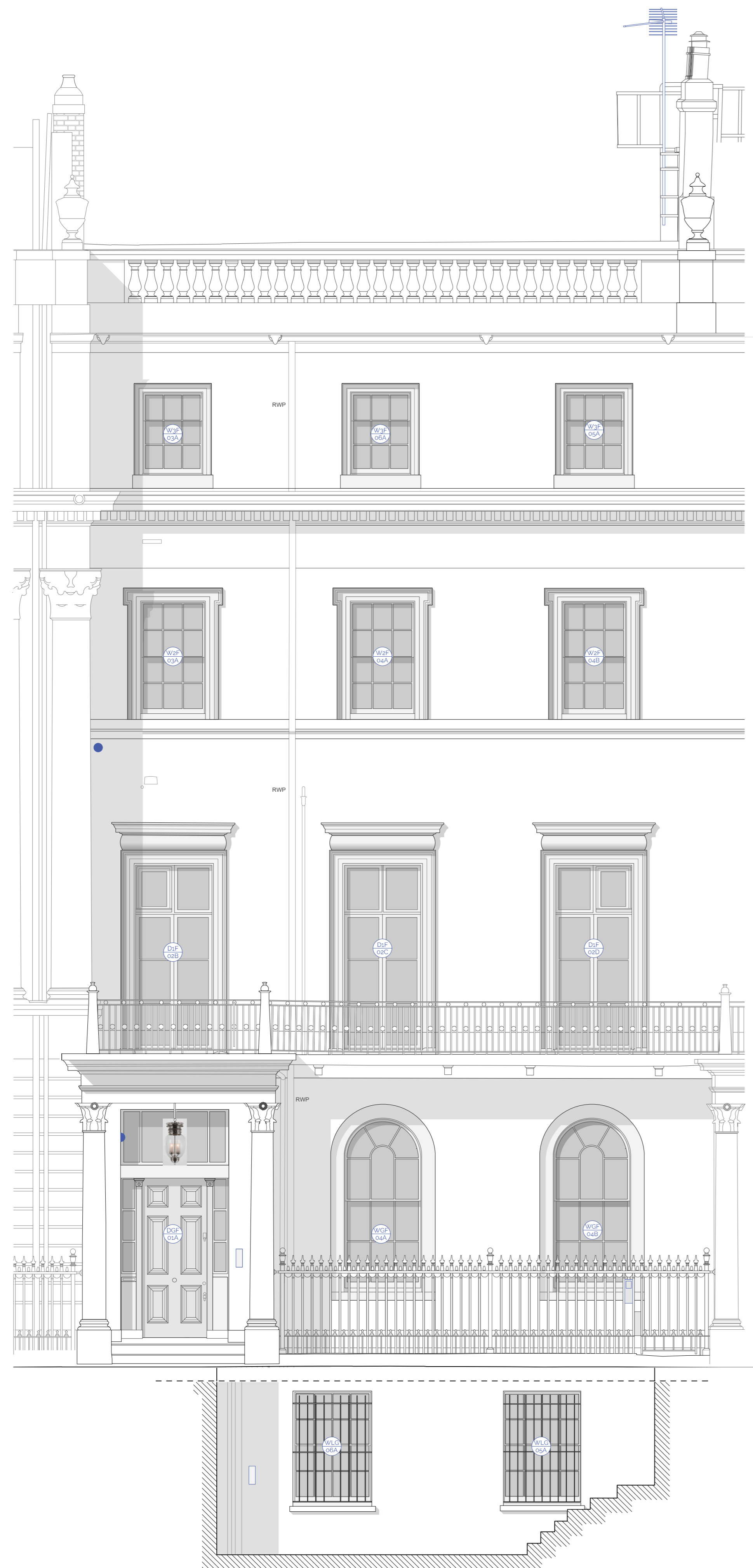
1 Main House front elevation 1:50 Elevation