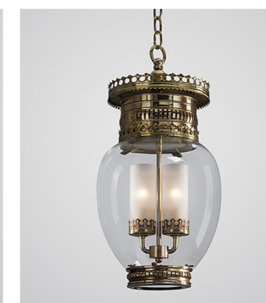
Small Size shown in Brass