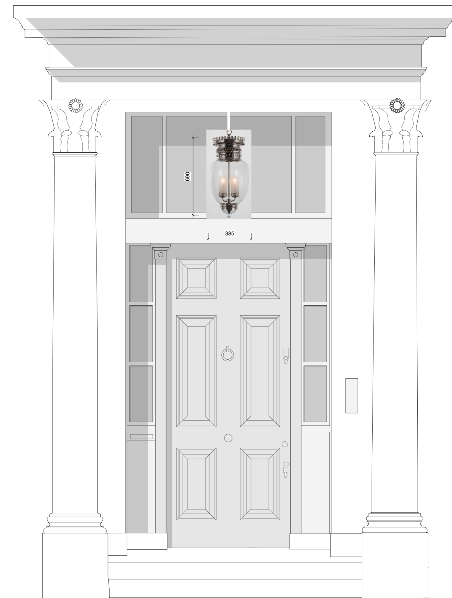
2 Front Porch 1:20 Elevation