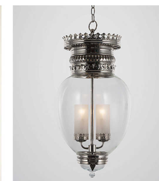
Large Size shown in Nickel