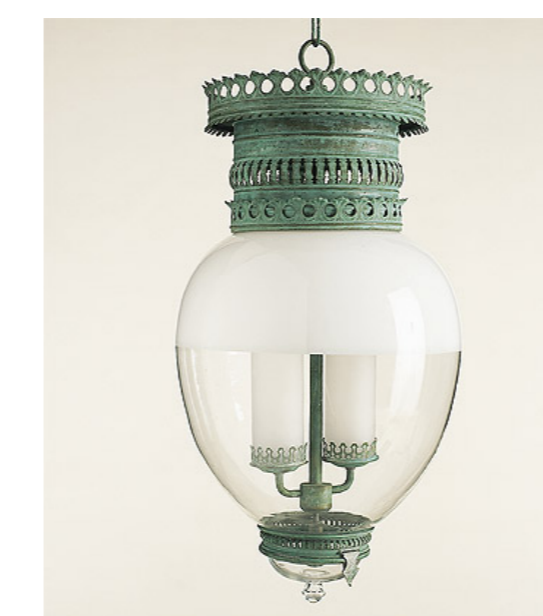
Large Size shown in Verdigris with Half-Frosted Glass