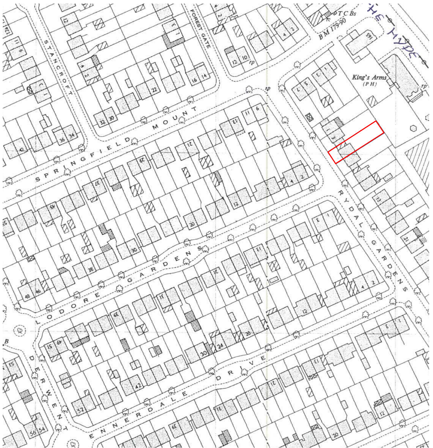
site plan - scale 1:1250