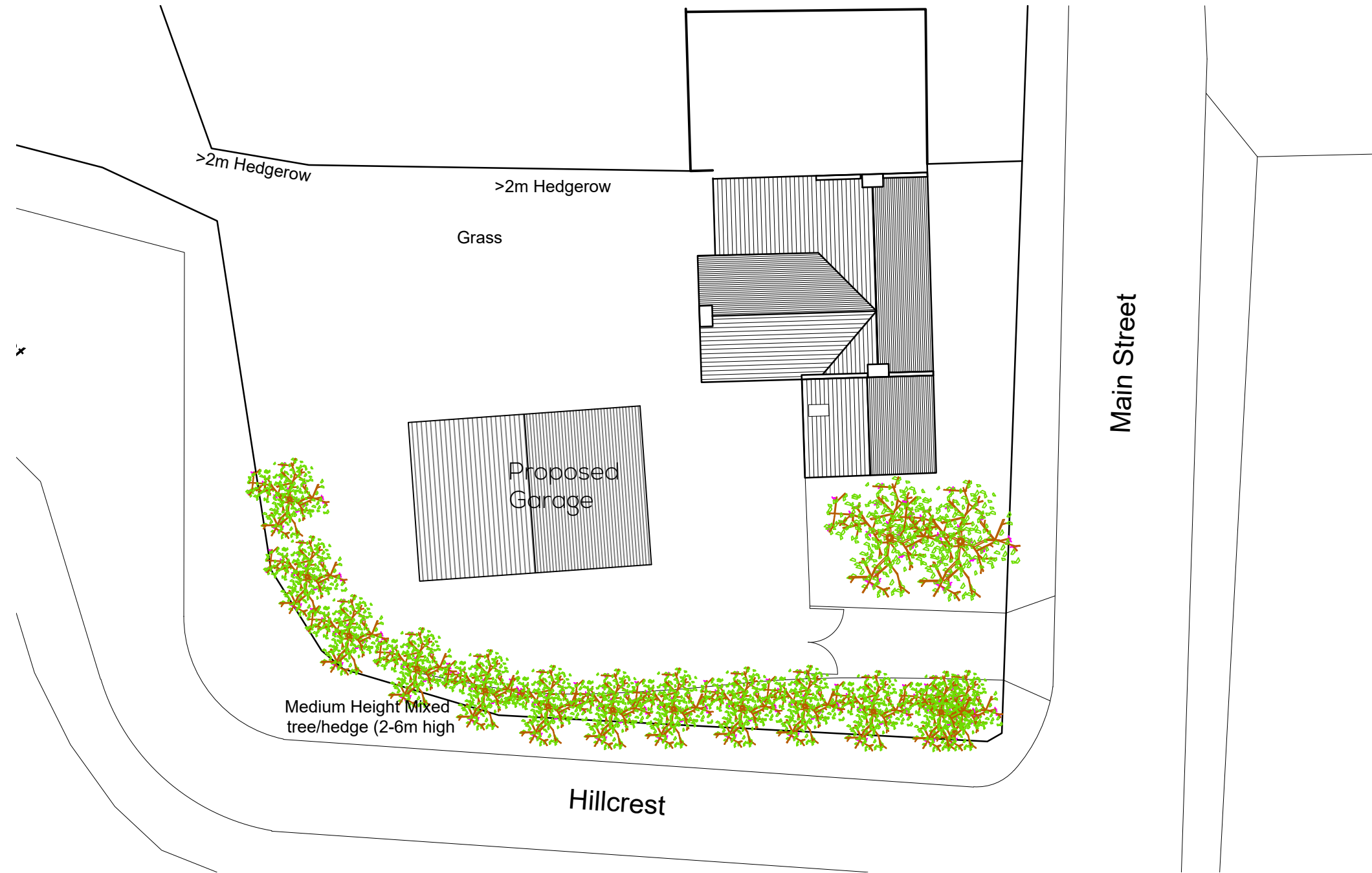
Proposed Site Plan Scale 1:200

NOTE: THIS DRAWING HAS BEEN PRODUCED BY ELECTRONIC MEANS. SHOULD THE SCALE MEASUREMENTS BE TAKEN BY MEANS OTHER THAN ELECTRONIC (e.g. FROM A PRINTED COPY), THE FOLLOWING MUST BE TAKEN INTO CONSIDERATION BEFORE SCALING IS UNDERTAKEN: 1. ENSURE THAT THE COPY HAS BEEN PRINTED/PLOTTED ON THE STATED SHEET SIZE WITH THE PLOTTING SCALE SET TO A CORRECT RATIO. 2. ENSURE THAT AN ADEQUATE ALLOWANCE (DEPENDANT ON THE STATED SCALE) IS MADE FOR THE INEVITABLE DISTORTIONS INTRODUCED BY PLOTTING/PRINTING AND COPYING PROCESSES. 3. MARKED CRITICAL DIMENSIONS ARE TO BE REGARDED AS HAVING PRECEDENCE OVER THE SCALED VALUES.