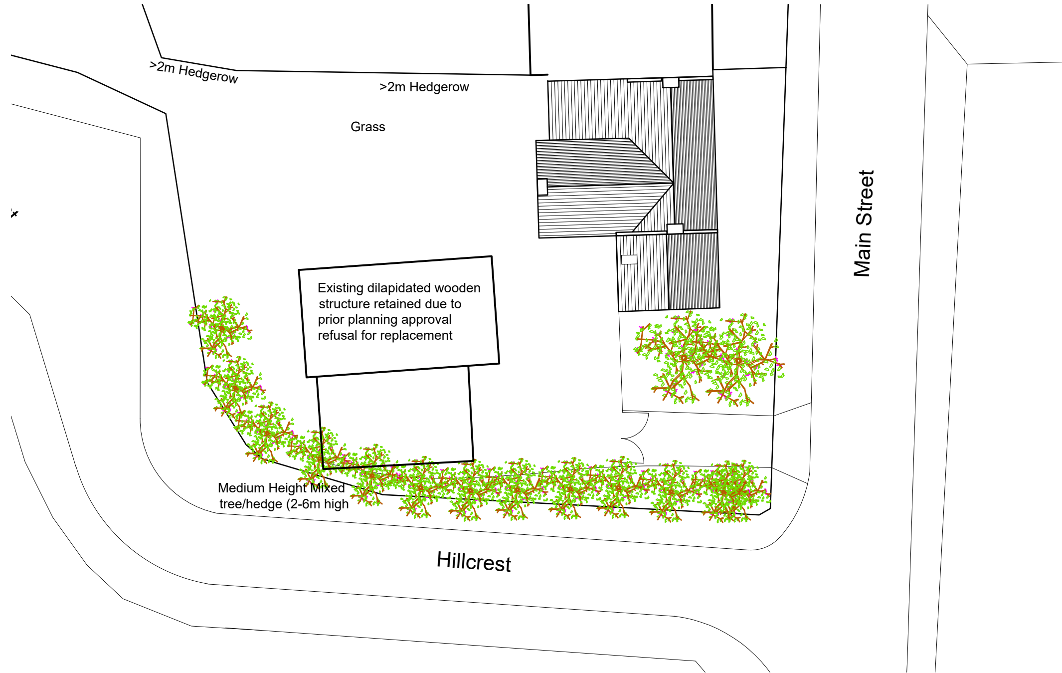
Existing Site Plan Scale 1:200

NOTE: THIS DRAWING HAS BEEN PRODUCED BY ELECTRONIC MEANS. SHOULD THE SCALE MEASUREMENTS BE TAKEN BY MEANS OTHER THAN ELECTRONIC (e.g. FROM A PRINTED COPY), THE FOLLOWING MUST BE TAKEN INTO CONSIDERATION BEFORE SCALING IS UNDERTAKEN: 1. ENSURE THAT THE COPY HAS BEEN PRINTED/PLOTTED ON THE STATED SHEET SIZE WITH THE PLOTTING SCALE SET TO A CORRECT RATIO. 2. ENSURE THAT AN ADEQUATE ALLOWANCE (DEPENDANT ON THE STATED SCALE) IS MADE FOR THE INEVITABLE DISTORTIONS INTRODUCED BY PLOTTING/PRINTING AND COPYING PROCESSES. 3. MARKED CRITICAL DIMENSIONS ARE TO BE REGARDED AS HAVING PRECEDENCE OVER THE SCALED VALUES.