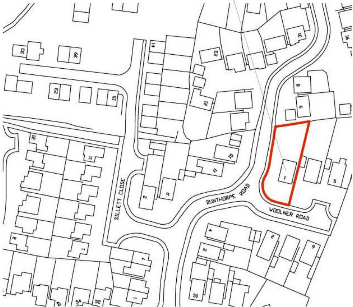
Site Location Plan 1:1250