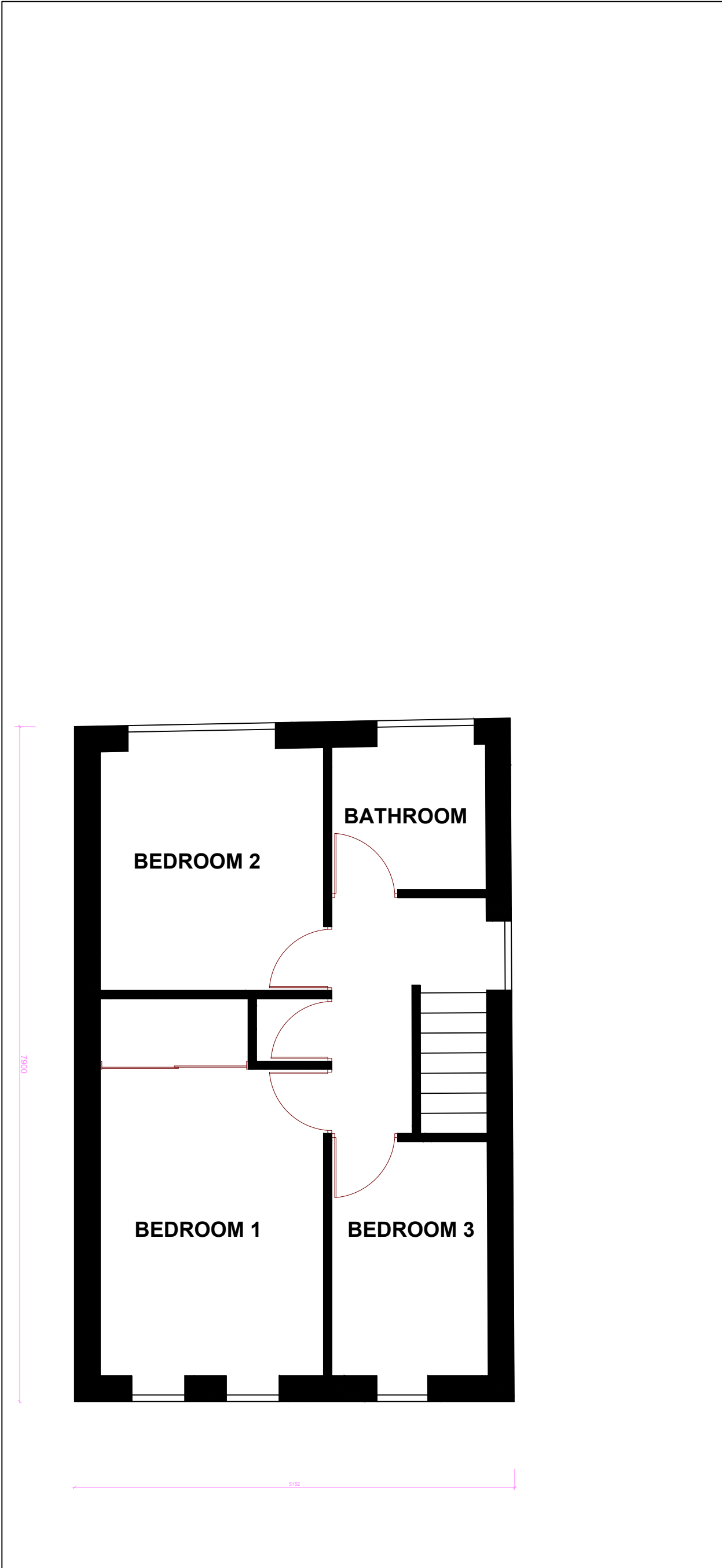
LEVEL 01 - EXISTING PLAN

NOTE: All structures are subject to SE detail and spec