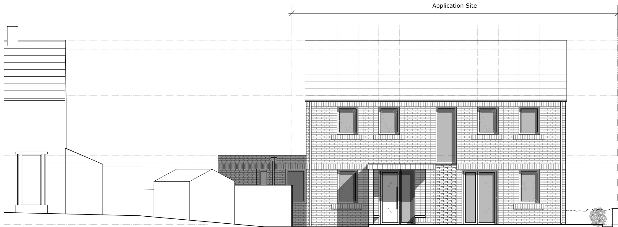
Front (south) Elevation