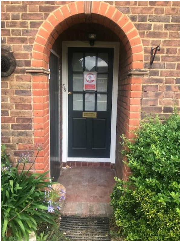
Photos front Elevation