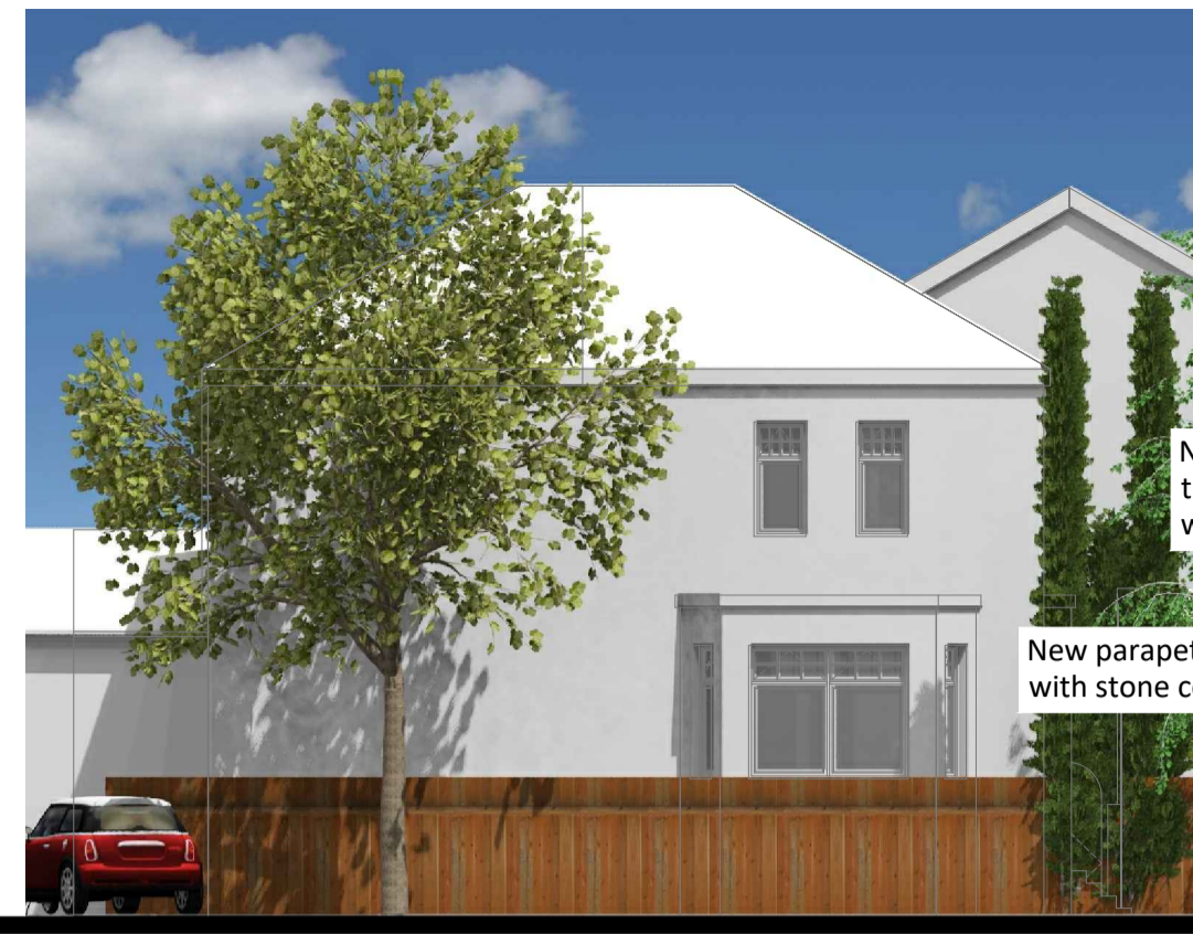
Elevation 2 Scale: 1/100

Existing middle window to bay to be removed and replace with French doors to client spec.