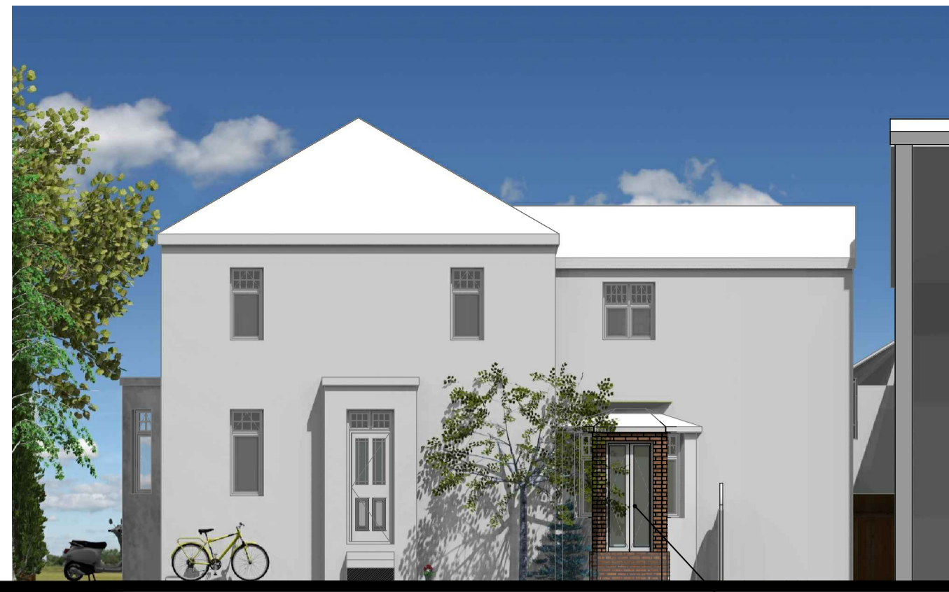
Elevation 1 Scale: 1/100

Existing middle window to bay to be removed and replace with French doors to client spec.