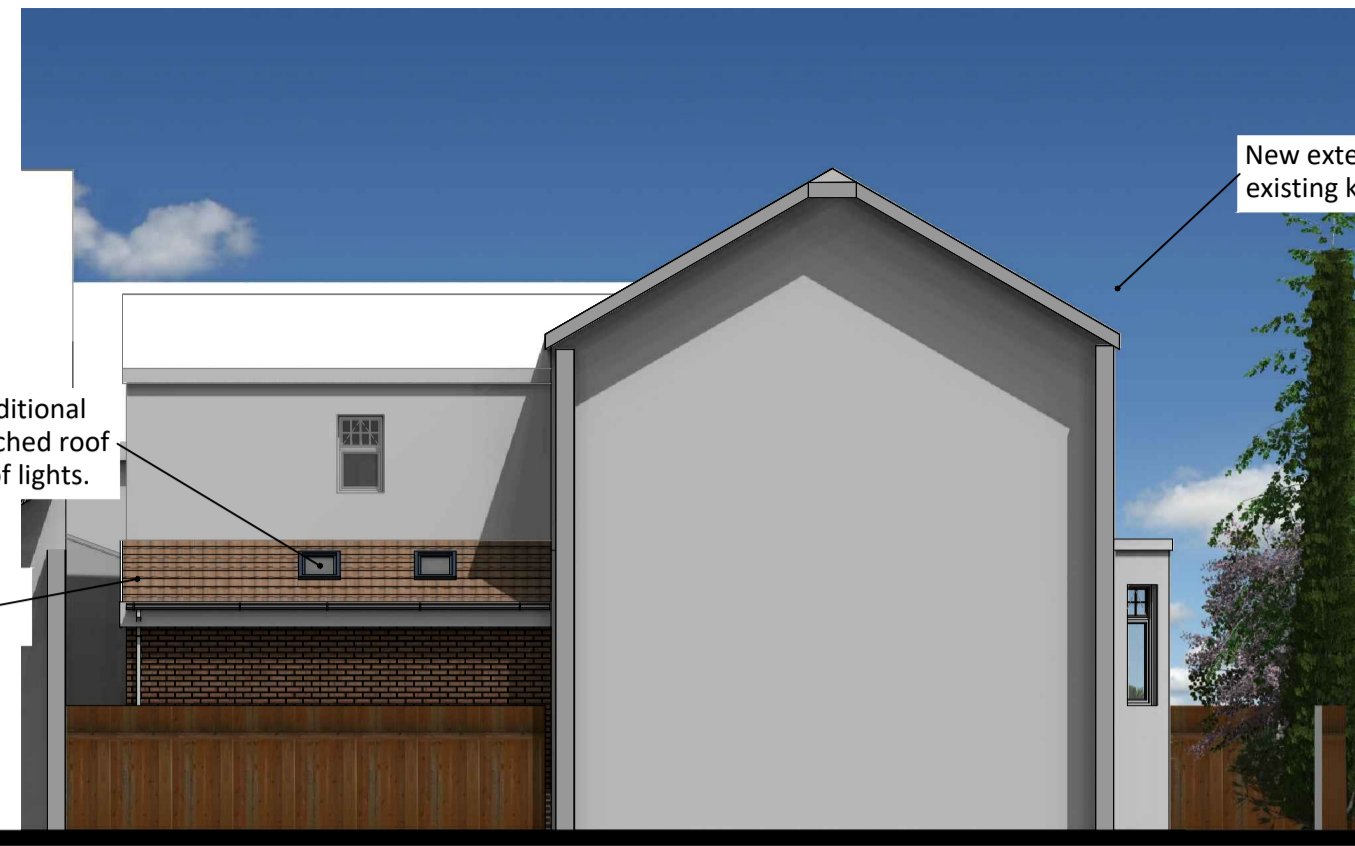
Elevation 3 Scale: 1/100

New traditional tiled pitched roof with roof lights. New parapet wall with stone coping.