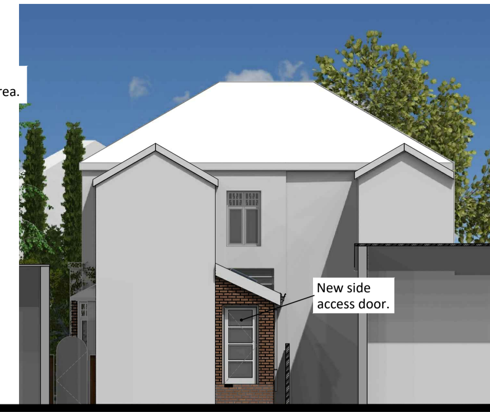
Elevation 4 Scale: 1/100