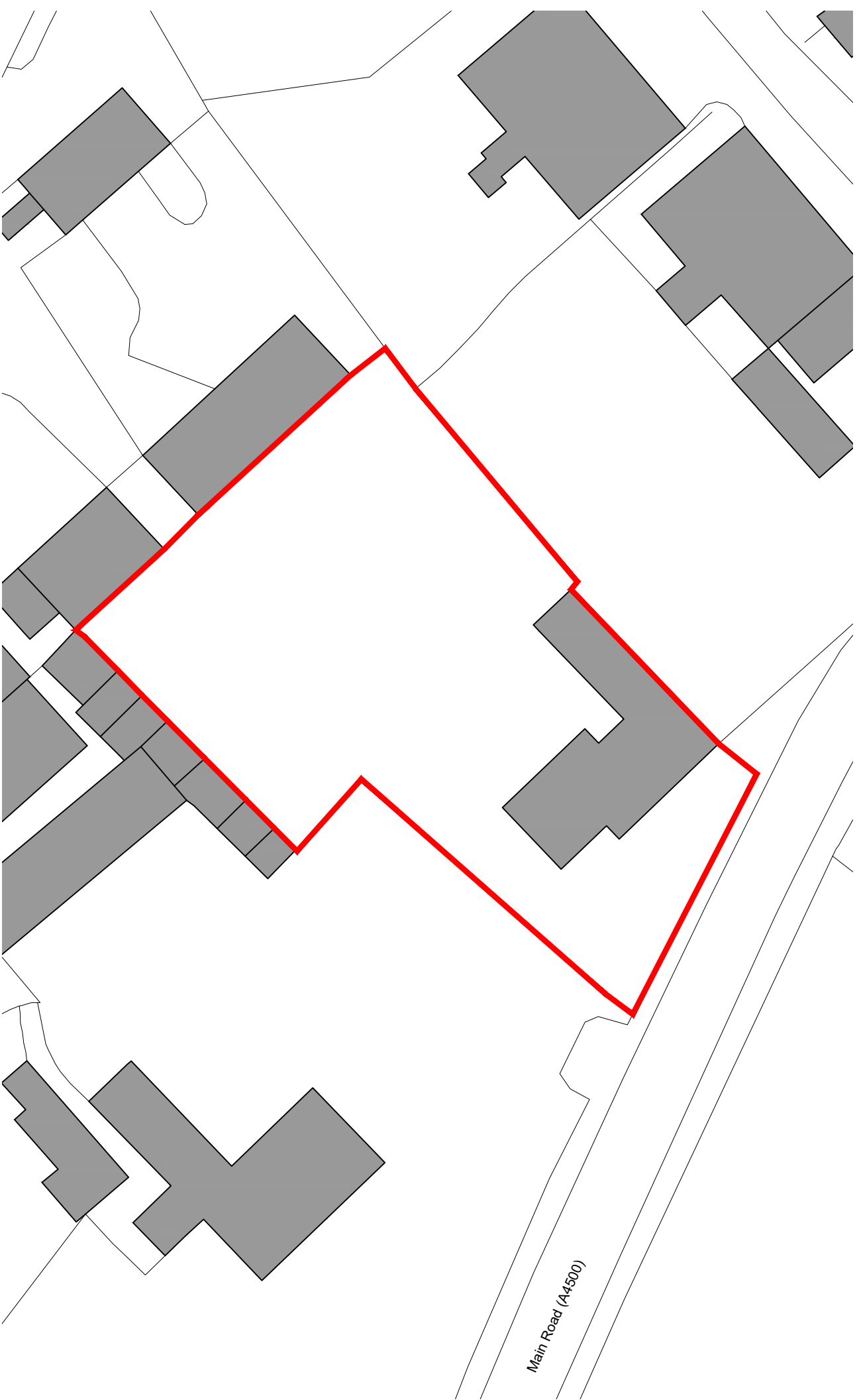
Site Location Plan Scale 1:500

Only agreed dimensions are to be taken from this drawing. All dimensions are to be checked on site before any work is put in hand. If it is found that this drawing does not conform with the approved plans, the drawing shall be amended accordingly. The drawing may not be copied, reproduced, or used in any way without the prior written consent of Scroxton & Partners. Scroxton & Partners shall not be liable for any loss or damage, whether direct or indirect, arising from the use of this drawing. © Copyright Scroxton & Partners