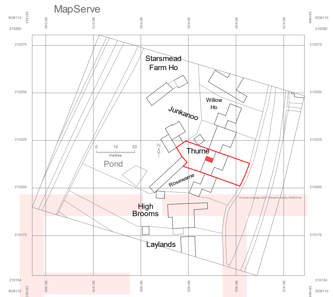
LOCATION PLAN 1:1250 @ A3