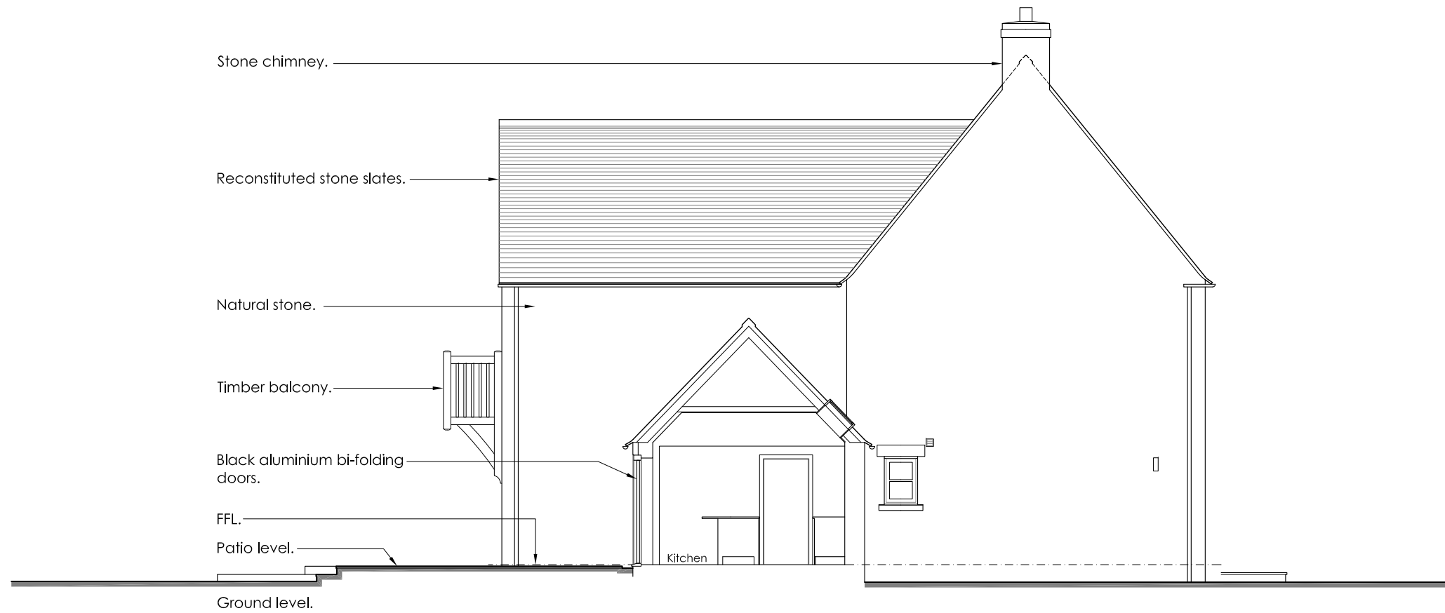
North Elevation & Section A - A