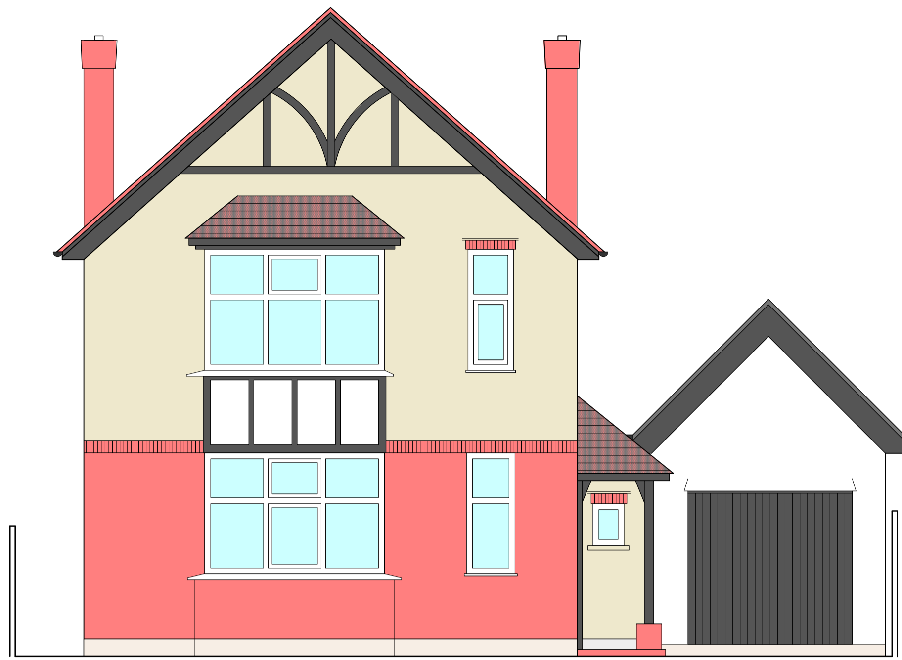
EXISTING FRONT ELEVATION A