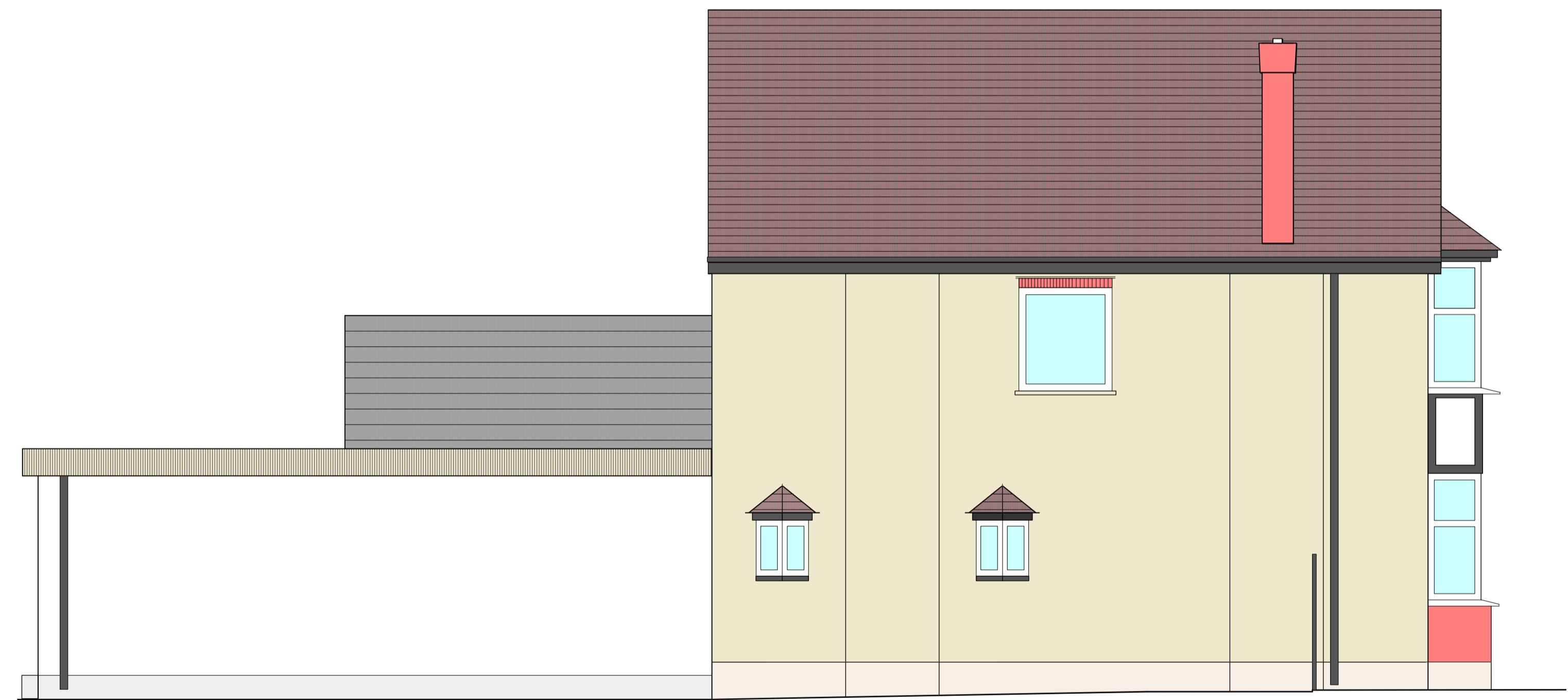
EXISTING SIDE ELEVATION D