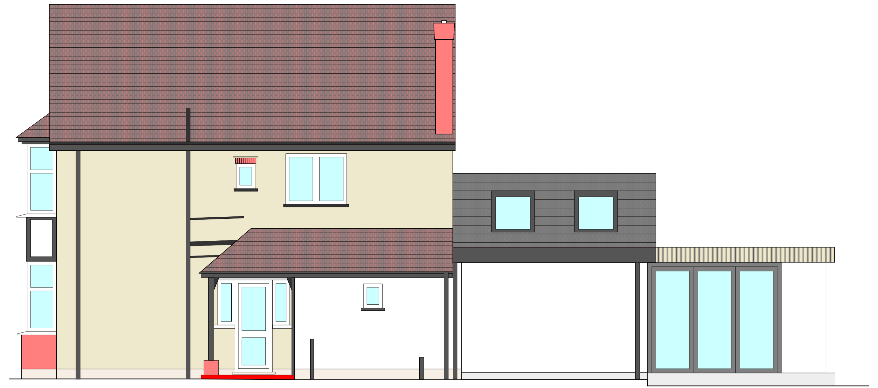
EXISTING SIDE ELEVATION B