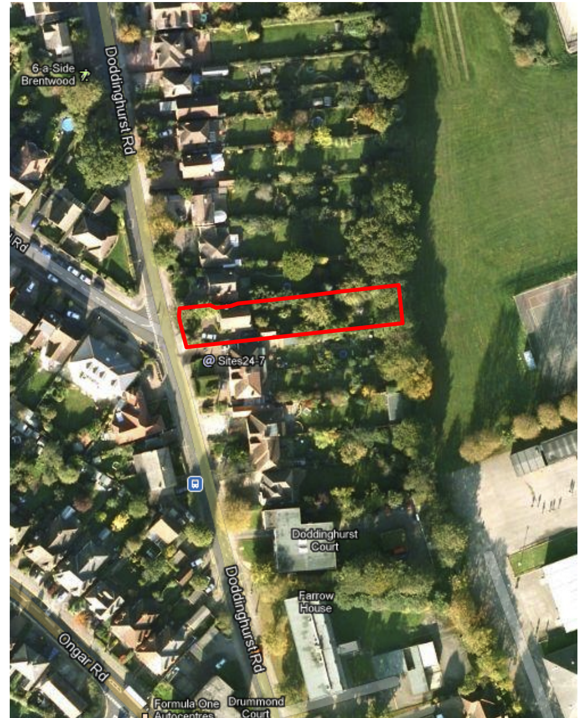
GOOGLE MAPS AERIAL VIEW - NOT TO SCALE

ADDRESS: 24 DODDINGHURST ROAD BRENTWOOD CM15 9EH