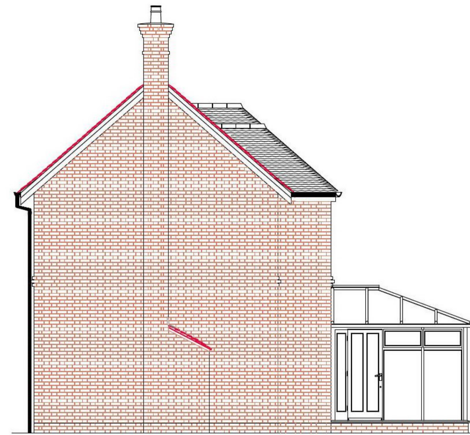
Existing East elevation