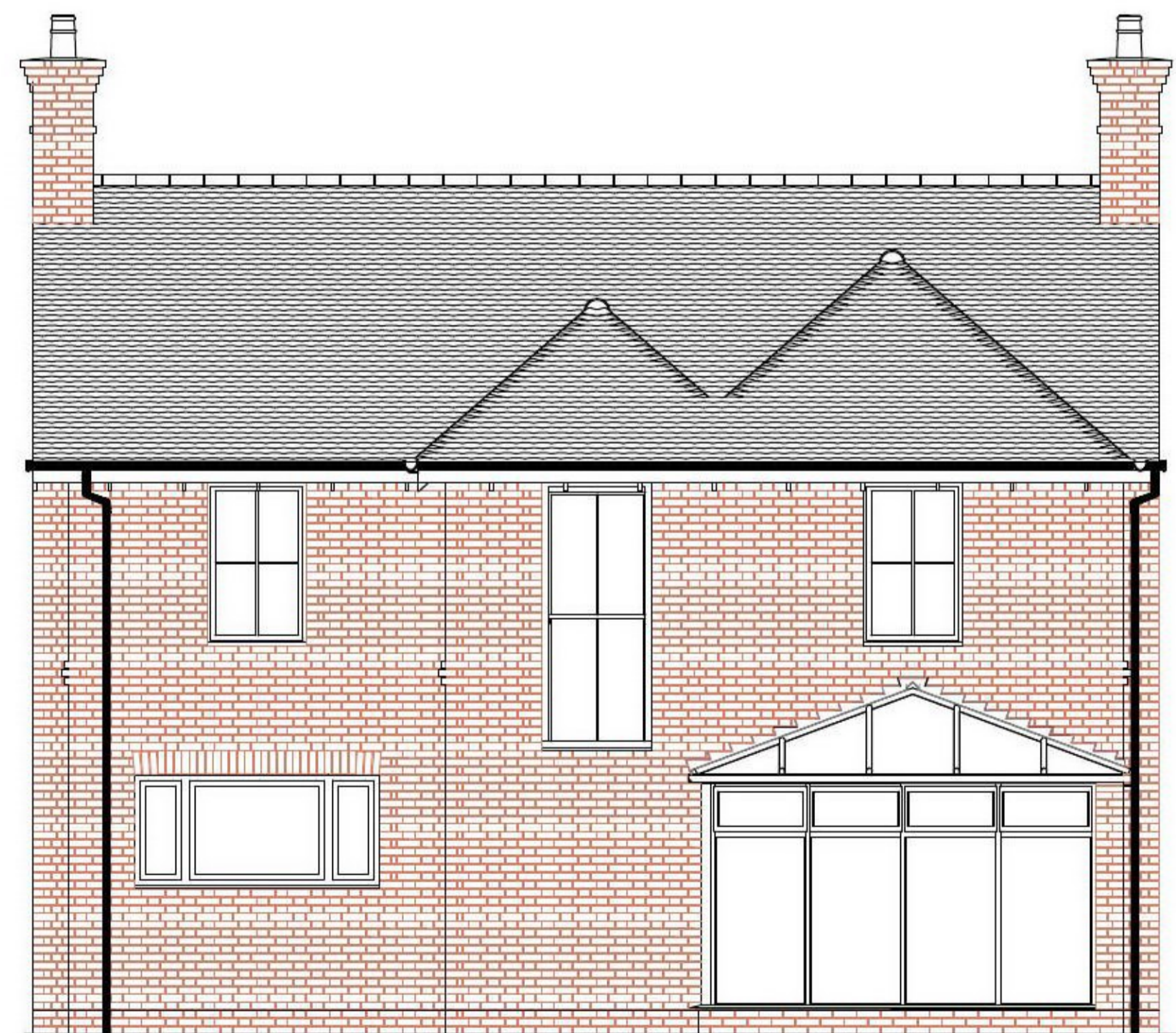
Existing North elevation