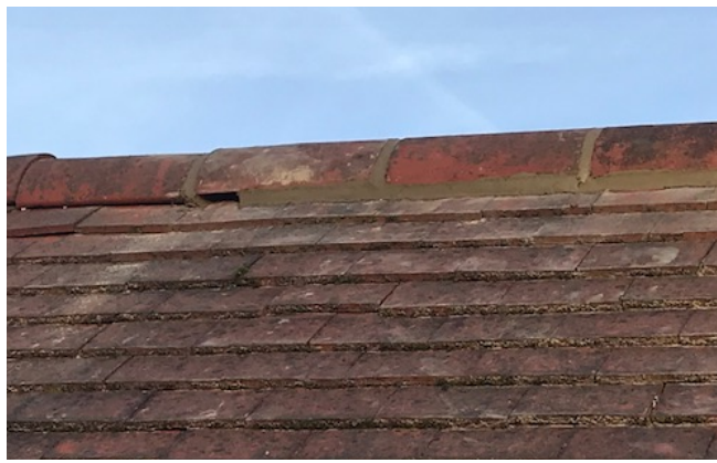
Example ridge access feature