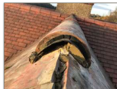
4. To ensure the three ridge tiles remain linked either; place a broken tile over the ridge and mortar only above the tile (left) or fill one side with mortar and leave the other side empty (do this on alternate sides to ensure the feature does not become draughty) (right).