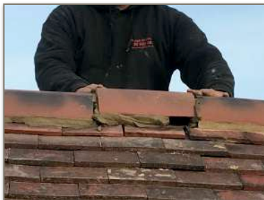
3. Leave the gap mortar free when bedding the tile onto the ridge.