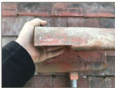
1. Notch out the underside of a ridge tile measuring 20mm high by 50mm wide.

Note: Use three adjacent ridge tiles for one Ridge Tile Crevice Feature