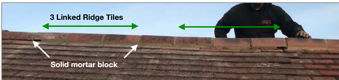
5. At each end of the three linked ridge tiles insert a solid mortar block to reduce through draughts.