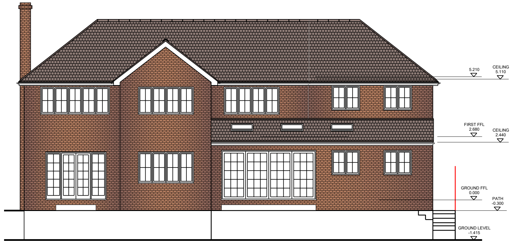
NORTH ELEVATION. (1:100)