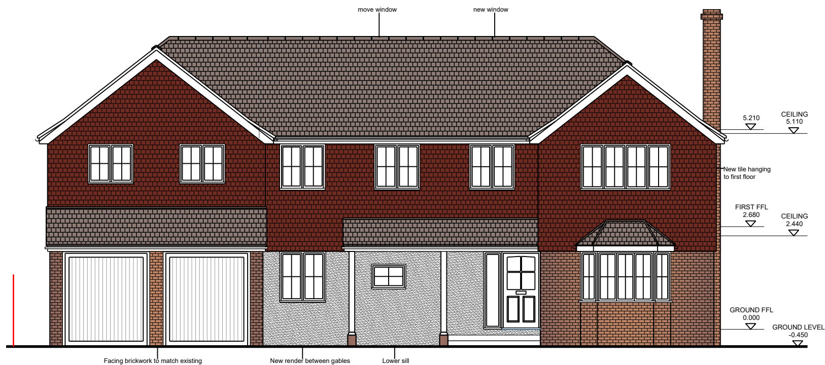
SOUTH ELEVATION. (1:100)