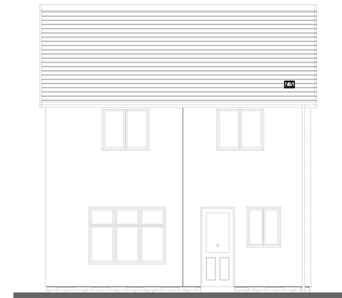
EXISTING NORTH EAST ELEVATION 1:100 @ A3