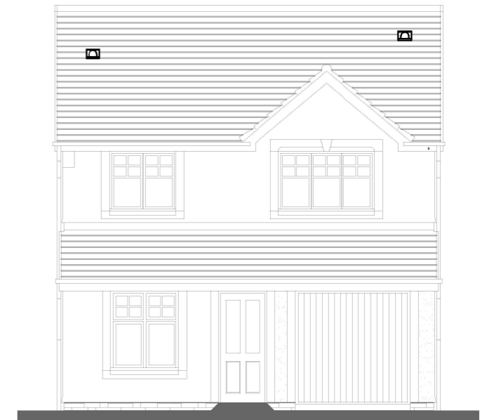
EXISTING SOUTH WEST ELEVATION 1:100 @ A3