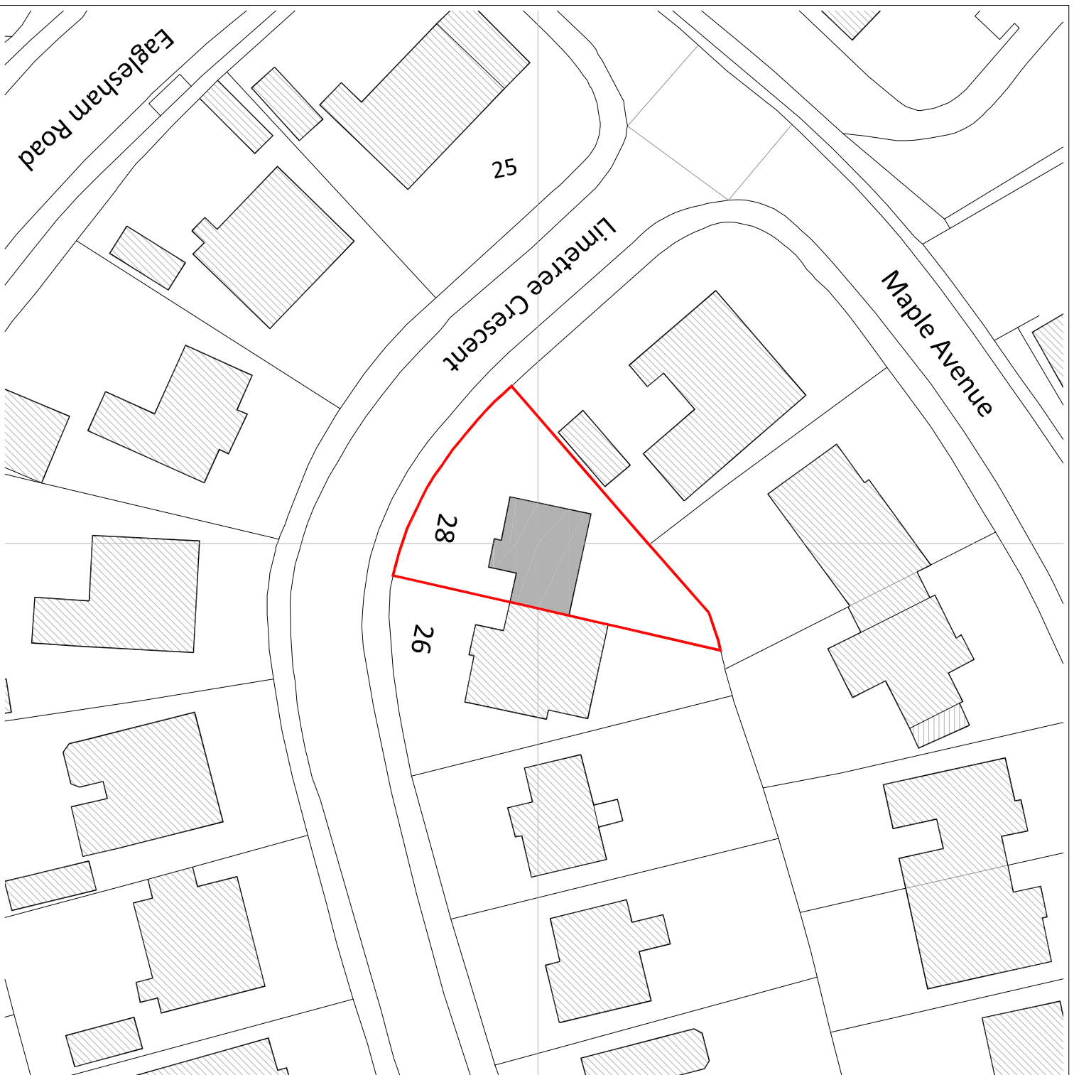
02 SITE PLAN - (Proposed) Scale: 1:1500 @ A3