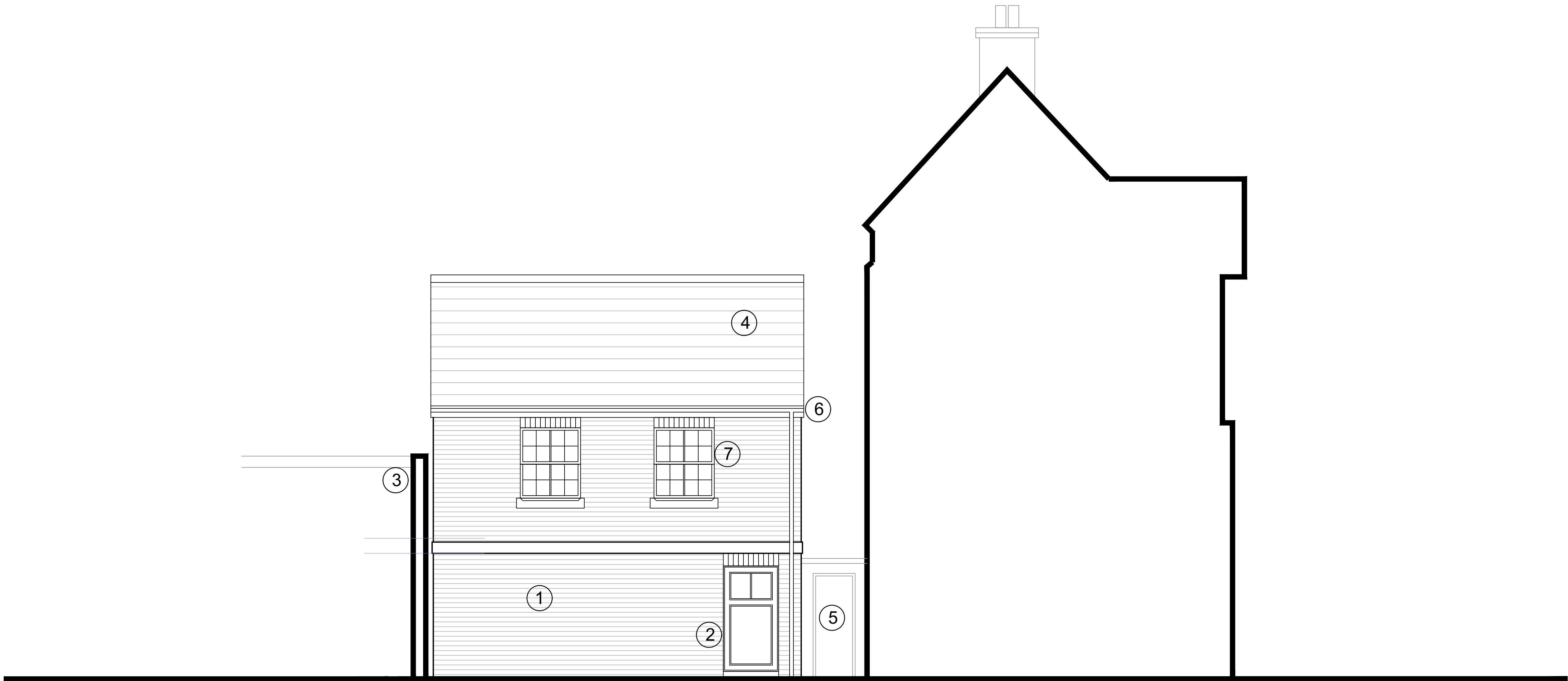
Proposed Garden Elevation of Coachhouse