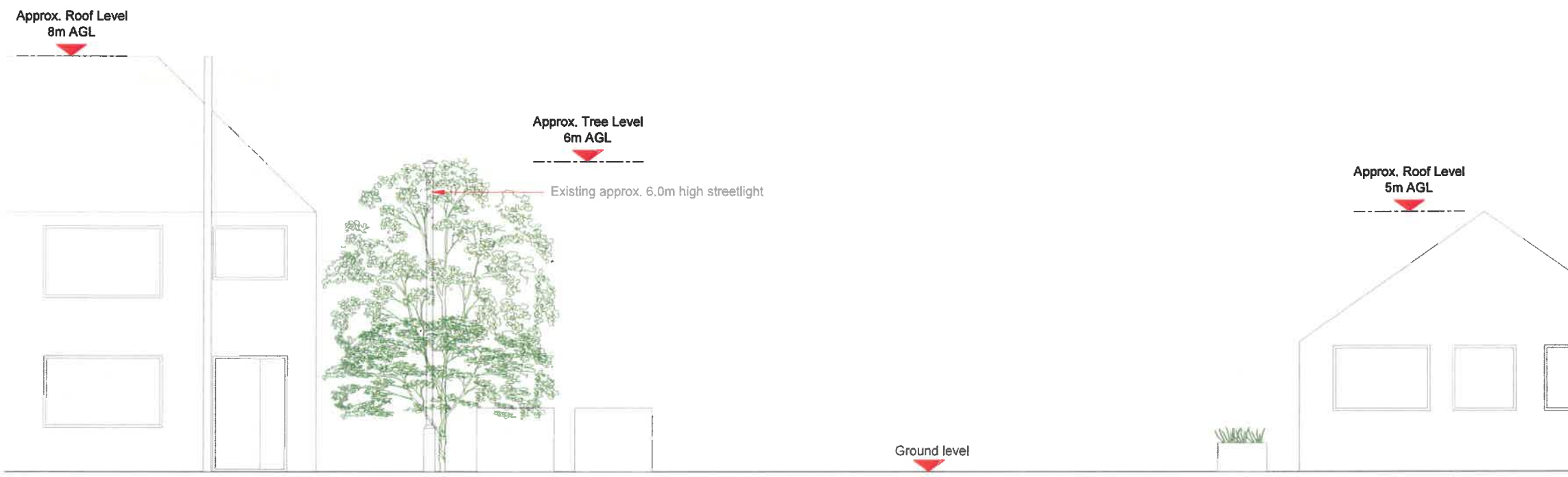
EXISTING ELEVATION A

Master Drawing No: FYD15019_M001 Issue: A