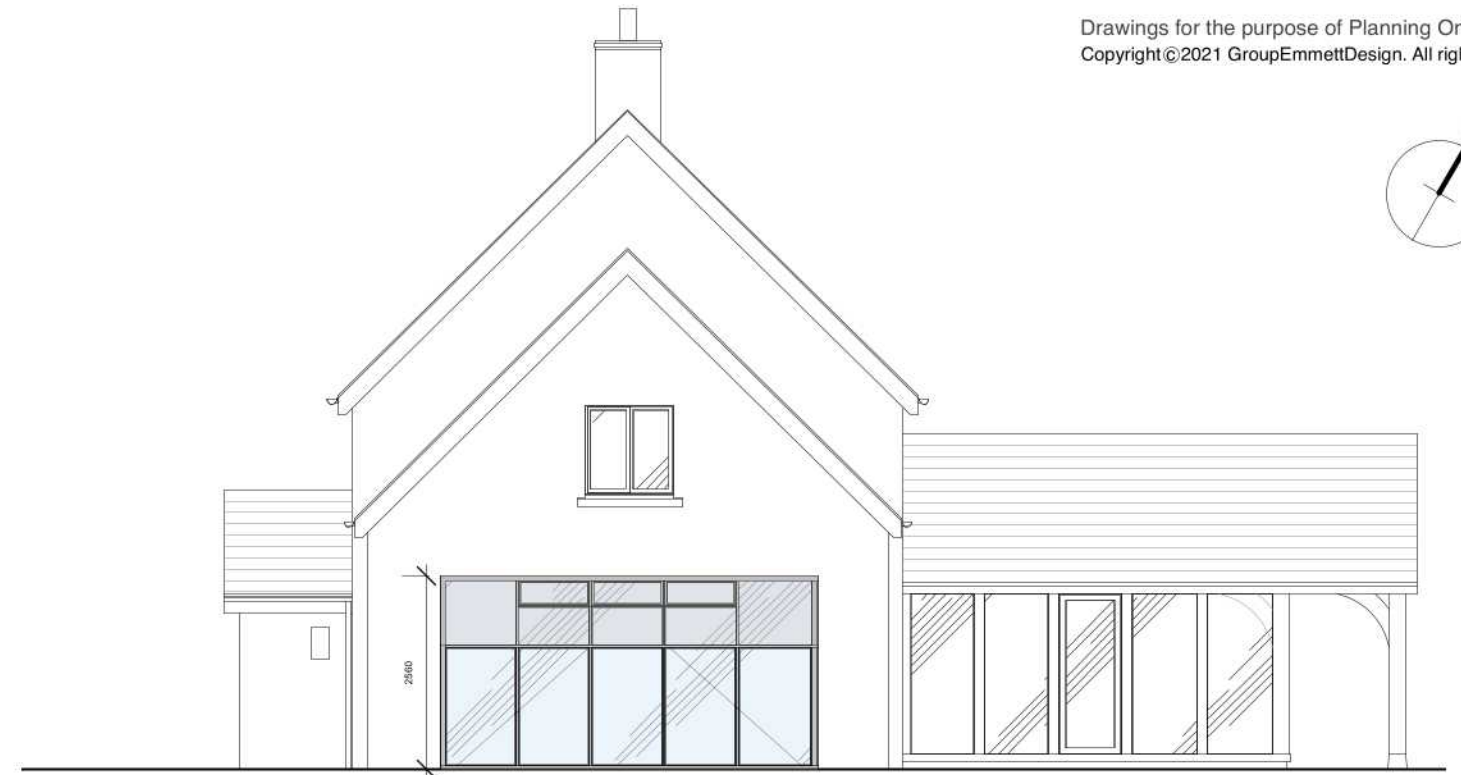
South West Elevation (as proposed) 1:100