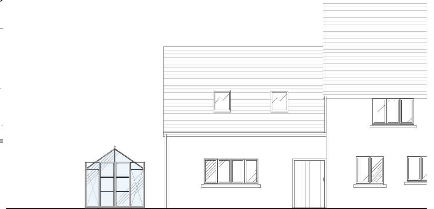
South East Elevation (as proposed) 1:100