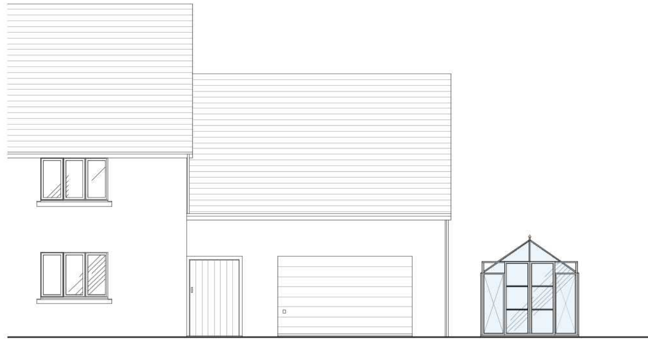
North West Elevation (as proposed) 1:100