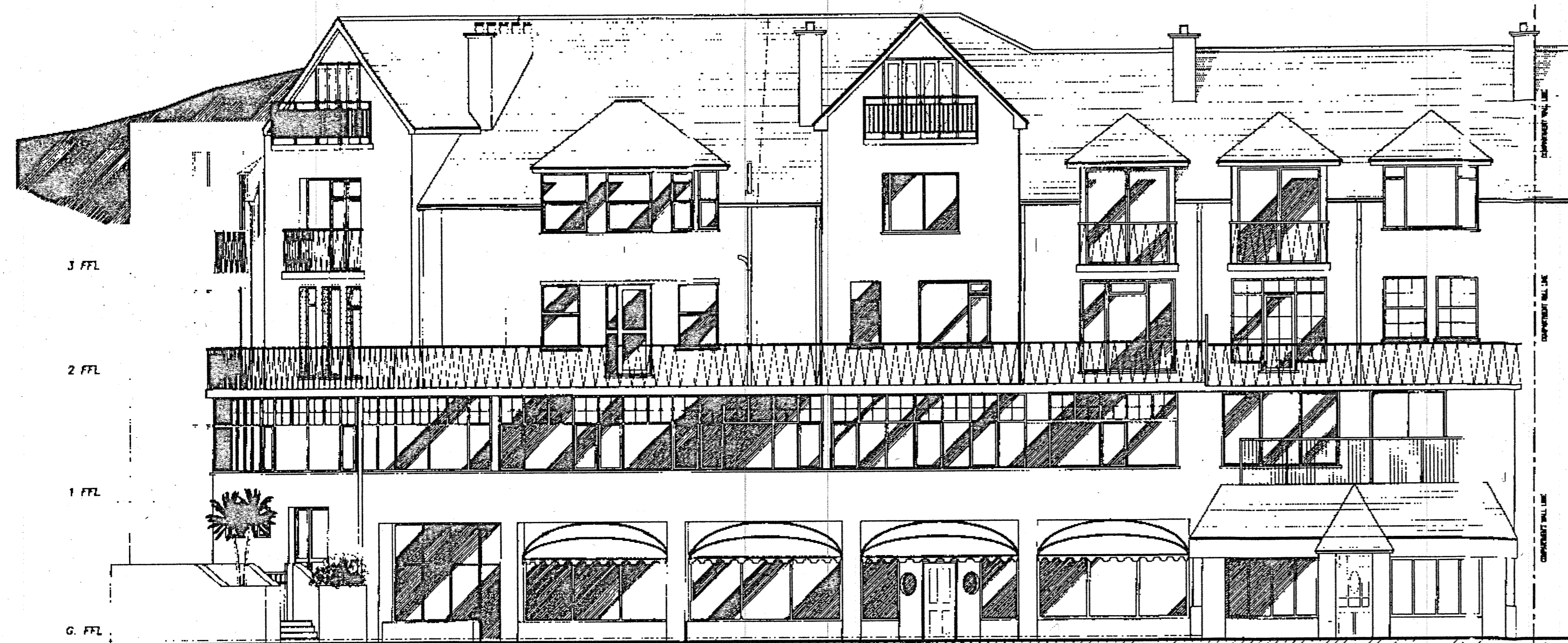
NORTH / EAST ELEVATION

This drawing is for information purposes only and dimensions should not be scaled. All dimensions must be checked onsite. If exact dimensions are required.