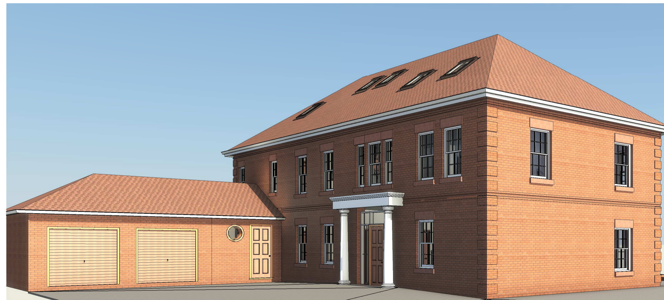
5 3d View North