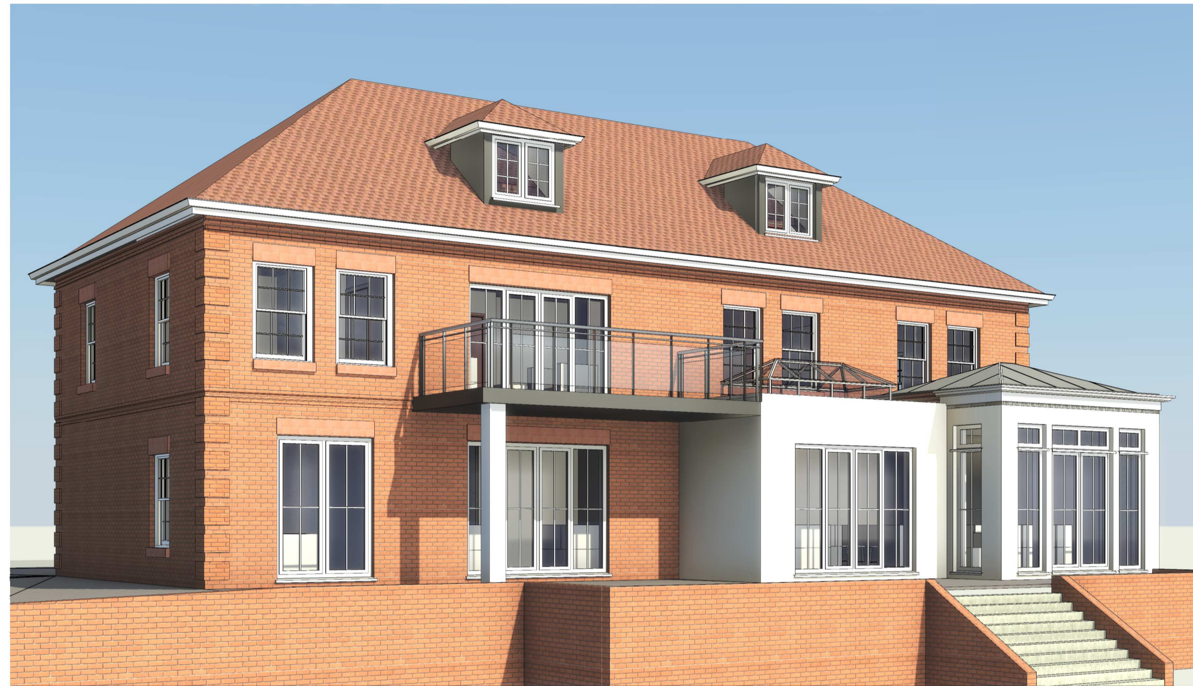
4 3D View West