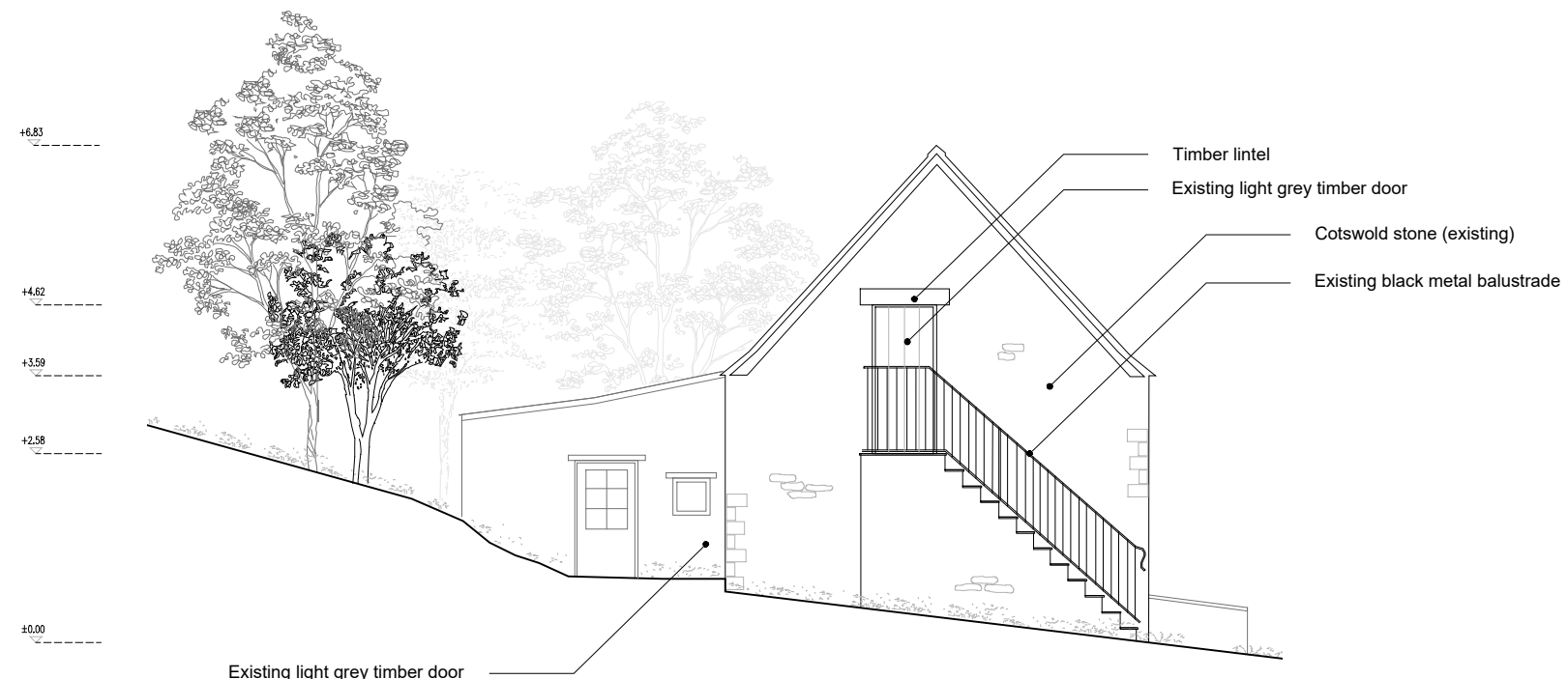
NORTH ELEVATION SCALE 1:100@A3