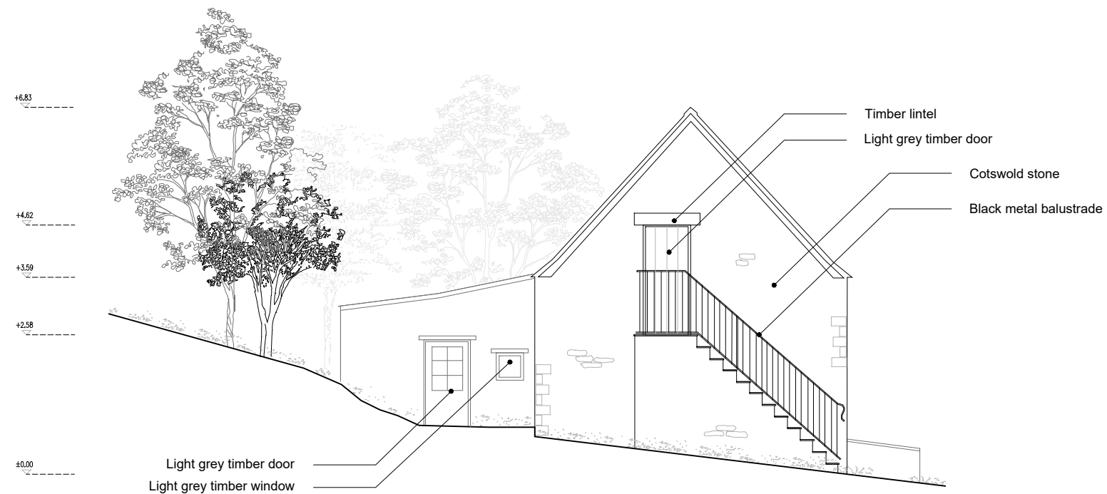
NORTH ELEVATION SCALE 1:100@A3